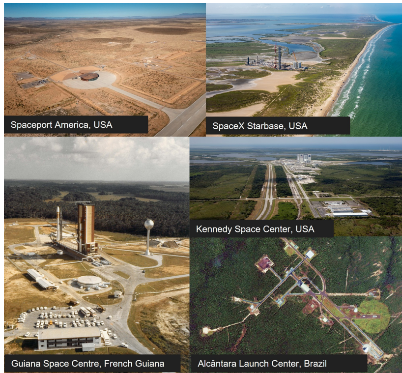
Fig. 2 Aerial spaceports view – clockwise from top left: Spaceport America [28], SpaceX Starbase [29], Kennedy Space Center [30], Alcântara Launch Center [31], Guiana Space Centre [32].