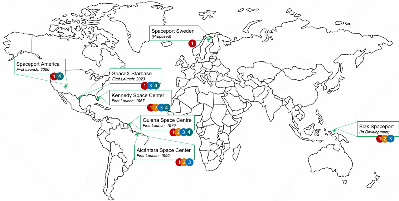
Fig. 1 Map of examined spaceports and corresponding community effects.