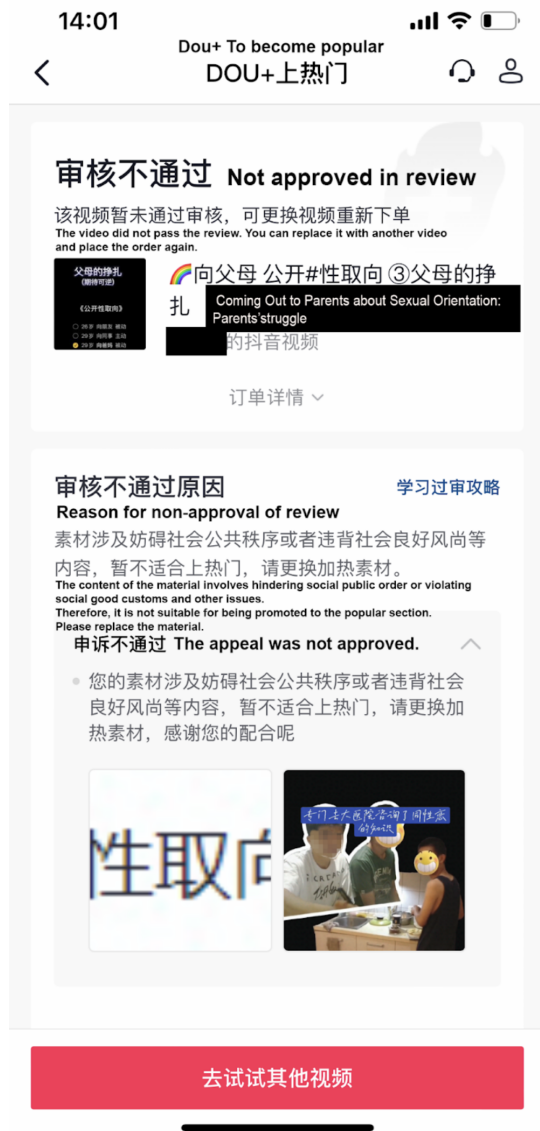
Figure 3: Dou+ informs a user that the purchase failed because the content review is not approved, signaling potential shadowbanning. (English translation provided in the image by the first author)

on their experiences and folk theories to increase their content’s visibility and popularity, even though doing so primarily involved avoiding posting explicitly queer content.