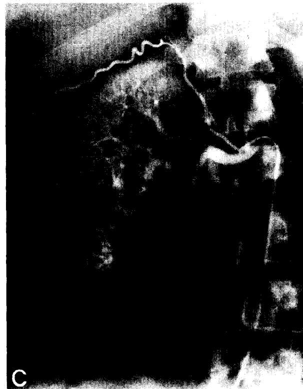
FIGURE 1. (A) Excretory urogram demonstrating typical sclerotic areas in spine and pelvis with bilateral renal masses. (B) Nephrogram phase of right renal angiogram demonstrating large tumor deformity with lucent areas. (C) Right renal angiogram demonstrating neovascularity, contrast pooling, and lucent areas within masses.