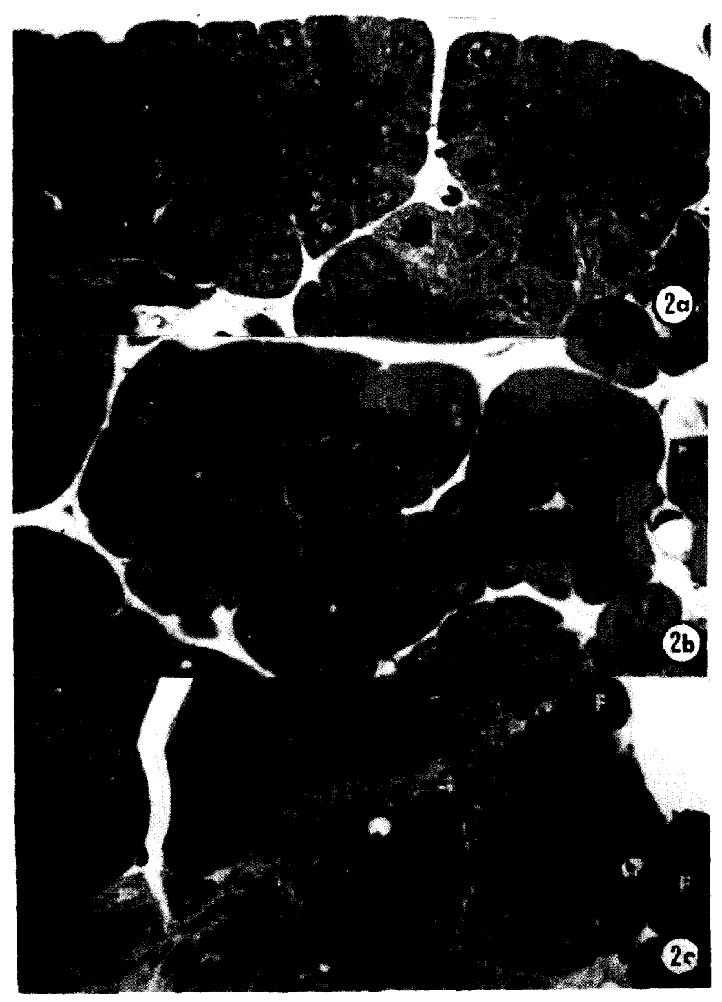
Fig. 2. Light micrographs of the pancreas from 2- (a), 18- (b) and 30-month-old (c) rats. The largest number of secretory granules is present in the acinar cells at 18 months and this correlates with the highest level of \alpha -amylase activity detected at this age. The number of secretory granules present in the pancreas of 2-month-old rats is smallest among the three age groups. This reduced number of granules may have resulted from a high level of secretory activity as indicated by the dilated lumens (L) of the acini. Fatty tissue present in the gland at 30 months is illustrated (F). \times 900