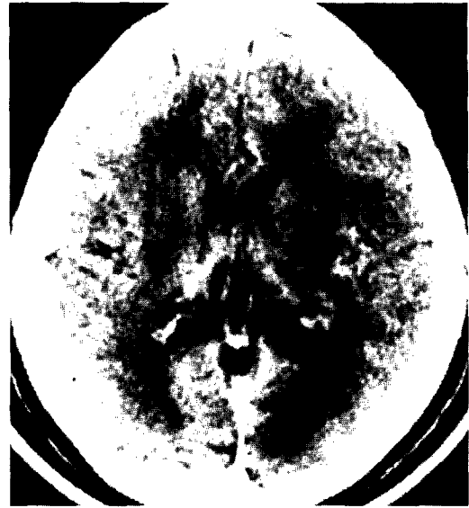
Fig. 1. Axial brain CT shows a radiolucent area (infarct) extending from splenium (anteriorly) to visual cortex (posteriorly) on left side. Patient manifested alexia without agraphia (pure alexia) and right homonymous hemianopia. Visual acuity was normal.

Although alexia without agraphia most frequently exists in the context of right homonymous hemianopia, it may rarely occur with normal visual