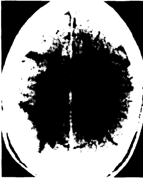
Fig. 3. Axial brain CT shows bilateral radiolucencies in the parieto-occipital regions believed to be watershed infarctions. Patient manifested simultanagnosia.