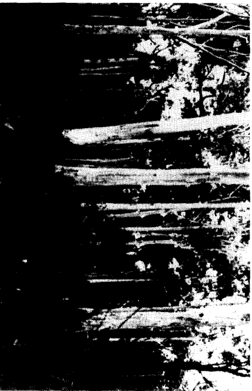
Fig. 1. Scenes representing the most preferred empirically-derived groupings. Scenes in the top row were included in the American-based "Denser forest and forest vista" grouping, while those in the bottom row were included in the Australian-student-based "Trees in forest". The scene top right was in both categories; the scene top left was one of the highest in preference for all three samples.