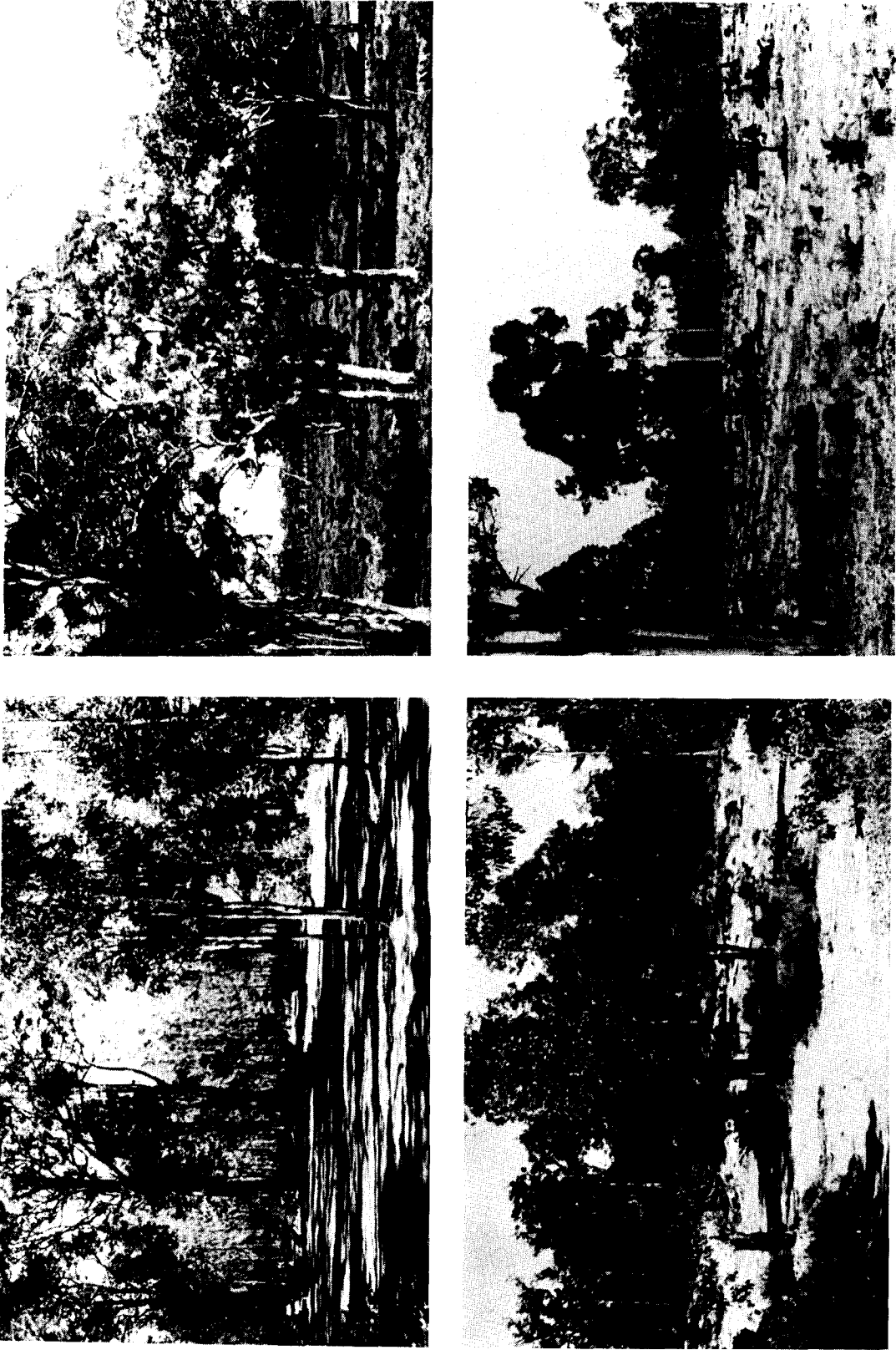
Fig. 2. All four of these scenes were preferred by the Wildflower Society over either student sample. All four were also included in the American-based "Open woodland/field" category. The two scenes in the bottom row represent the Australian-based "Arid, open, coarse texture" grouping.