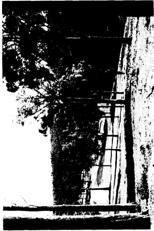
Fig. 3. (Top row.) These scenes are from the American-based "rough-textured, arid wooded" grouping. In both cases the Wildflower Society members significantly preferred these to their fellow Australians who, in turn, appreciated them significantly more than did the American students.