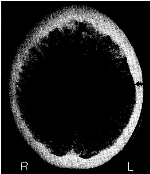
FIGURE 1. CT transverse section of the brain showing a region of low attenuation in the high left parietal lobe (arrow) representing the left parietal infarction. The small left centrum semiovale lacunar infarct is seen just medial to the cortical infarct.

area of cortical substance loss in the high left mid-parietal region consistent with an old infarction. A cerebral angiogram was performed (Figure 2) that showed bilateral narrowing of the supraclinoid arteries, measured to be 30% of normal diameter on the right and 20% of normal diameter on the left. There was a prominent collateral network of vessels extending into the basal ganglia (the Moyamoya vessels).