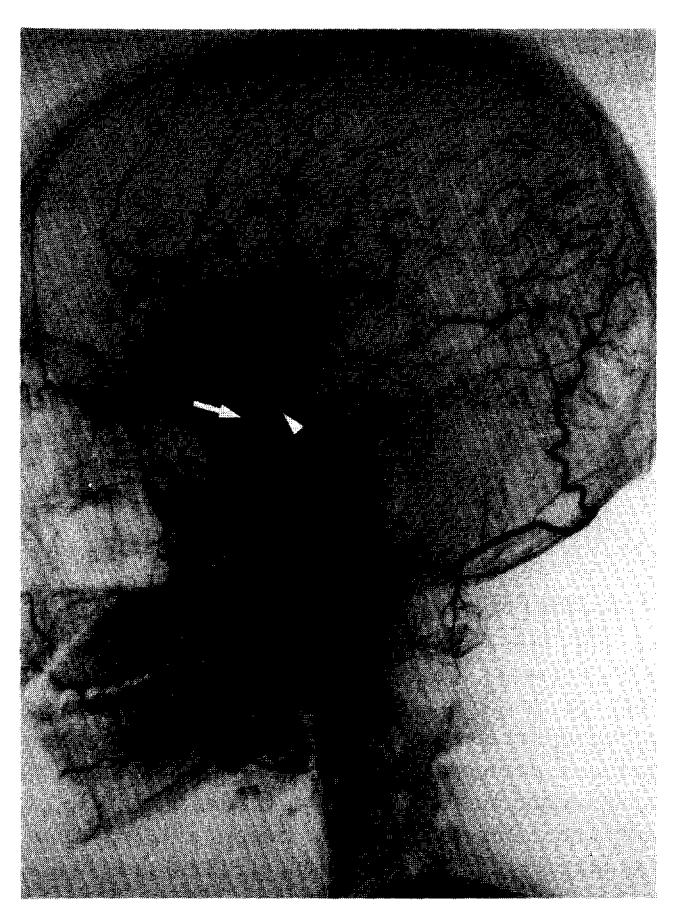
FIGURE 2. Lateral skull angiogram showing narrowing of the supraclinoid portions of the internal carotid artery ( arrow ) and the Moyamoya vessels ( arrowhead ).

Unit dose kits for the preparation of <sup>99m</sup>Tc-HM-PAO were supplied by the Amersham Corporation and were reconstituted with 25-30 mCi of sodium pertechnetate in 5 mL of sterile saline eluated from