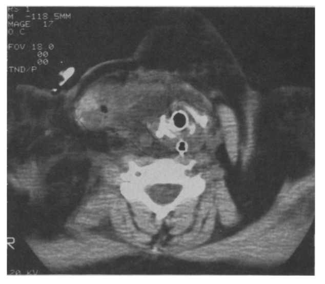
Figure 2. Computed axial tomographic scan of neck showing right paratracheal fluid accumulation with shift of trachea to the left.

right paratracheal area with marked left shift of the trachea with the endotracheal tube in place (Figure 2). The patient was taken to the operating room, where marked edema of the right side of the neck was noted without evidence of blood or pus collection. A tracheostomy was performed and a drain placed. Mechanical ventilation was discontinued 3 days later.