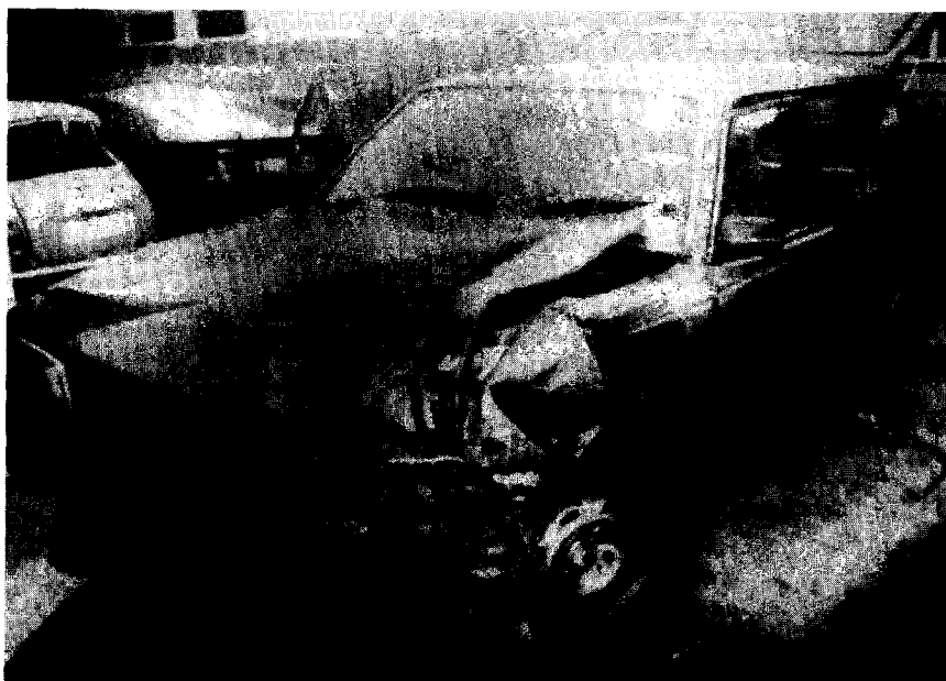
Fig. 5. Passenger side frontal crash. The 91-year-old, female, lap-shoulder belted passenger sustained a C4/C5 noncontact fracture. Multiple belt related injuries were also reported.

tively minor damage were identified with nonhead impact cervical spine fractures or dislocations to belted adult drivers or passengers (Huelke et al. 1992a).