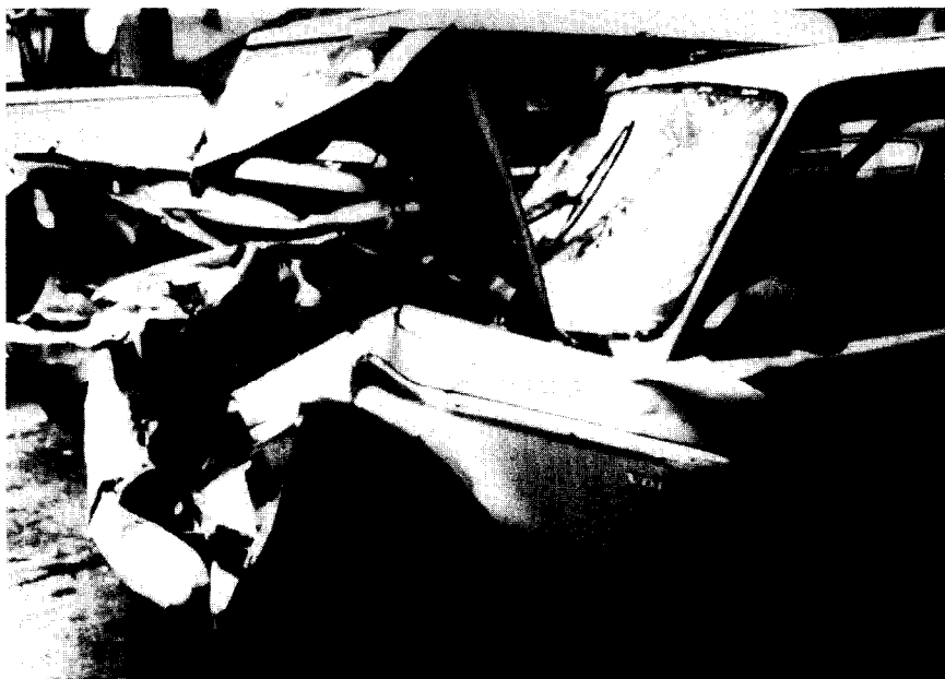
Fig. 6. Offset frontal crash. The female front left passenger had multiple rib fractures from the lap-shoulder belt webbing and a C5 body fracture without head impact.

month-old female, properly restrained in a child seat, involved in a frontal crash. The front seat restrained parents were not injured.