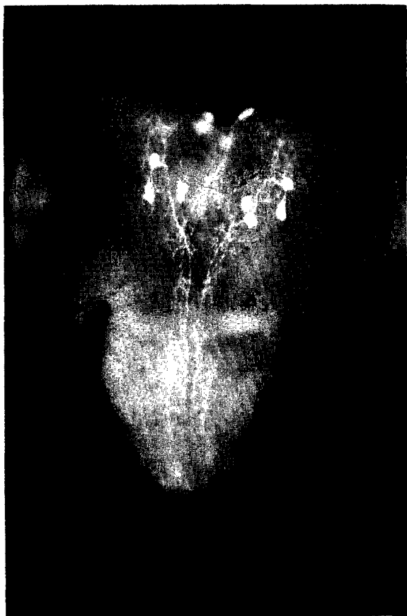
Fig. 2 DMS and DSK I immunoreactivity in the third instar larval central nervous system. Both sequence-specific primary antisera were detected with FITC-labeled goat anti-rabbit antisera in the same tissue. The result was an increase in the number of cells containing immunoreactive material.