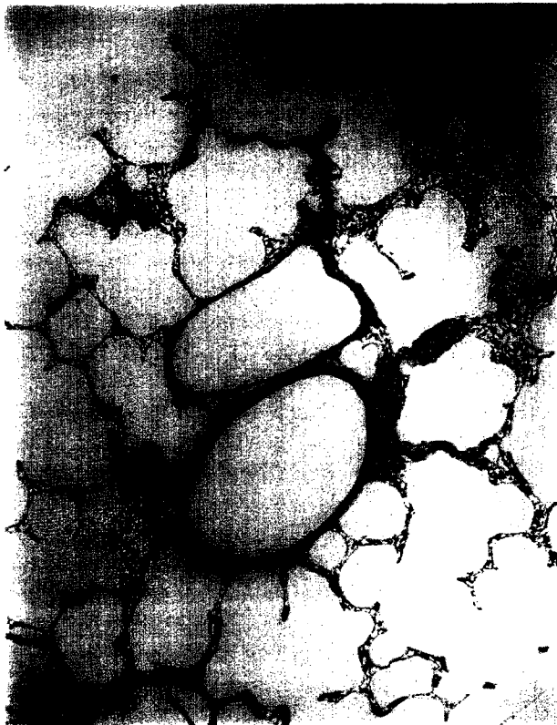
Fig 2. Lung from control animal (TV 5 mL/kg) showing small artery and bronchus, normal alveolar architecture and no perivascular edema (original magnification × 250).

The histologic changes from 20 mL/kg overinflation were not dramatic. Minimal perivascular edema was seen in the 20 mL/kg group. None was seen in the animals ventilated at normal tidal volume of 5 mL/kg.