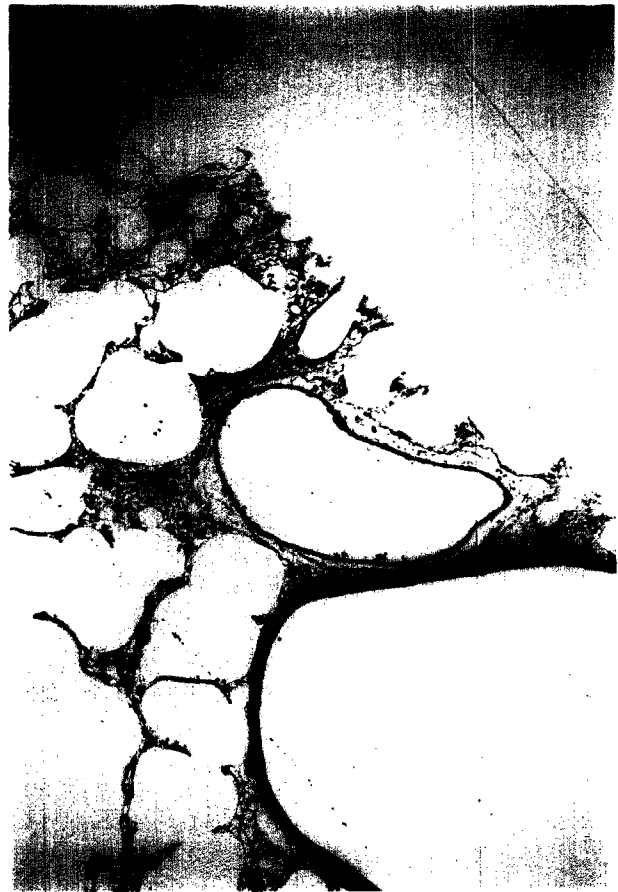
Fig 3. Lung from tidal volume 20 mL/kg animal. Note slight edema around small artery (original magnification × 250).

Of note, perivascular edema is the first histological change noted in the more dramatic overdistension lung injury models.