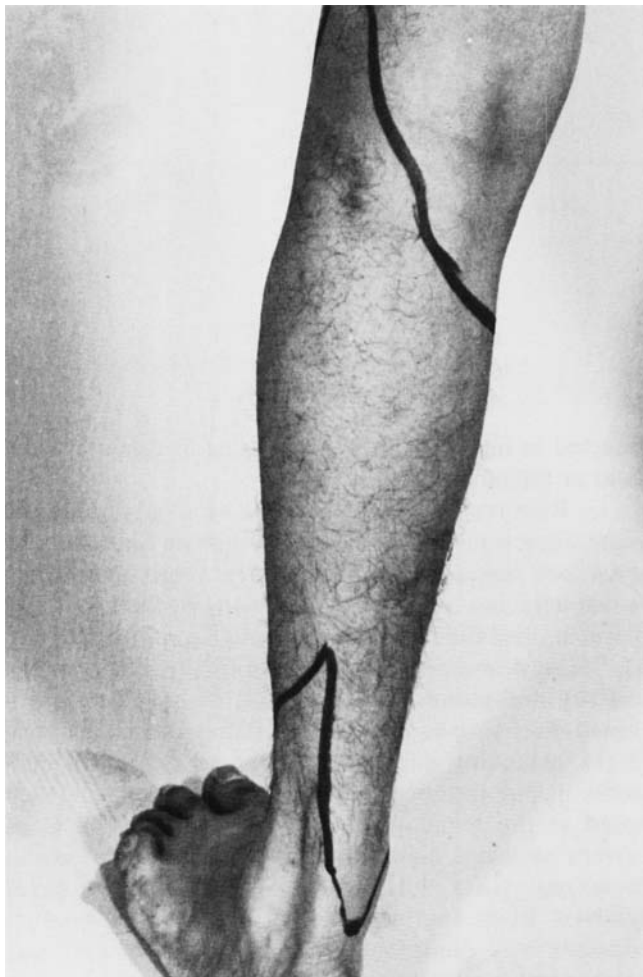
Fig 2A. Case 4. Posterior aspect of the left lower leg 4 days after synovial rupture. Superior and inferior boundaries of the ecchymotic zone are outlined by skin pencil. The ecchymosis includes most of the calf and has not yet extended to the ankle.

Comment. In this case we observed the sequence from the very beginning, starting with a painless hemarthrosis