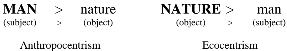
Figure 1 Anthropocentric and Ecocentric Metaphysics

The deep reason for our moral confusion and polarizing politics about the environment lies in our very conception of man and nature. Debate between anthropocentric and ecocentric environmentalisms reflects an inherently unstable and inevitably fatal metaphysic. This is the two-term metaphysic of Rene Descartes that distinguishes mind from body, mind from matter, and mind from nature. This is the two-term metaphysic of modern science that relates mind and nature as subject and object. By its lights, there is only man the subject and nature the object, and between them there is only the question of which of the two has priority.