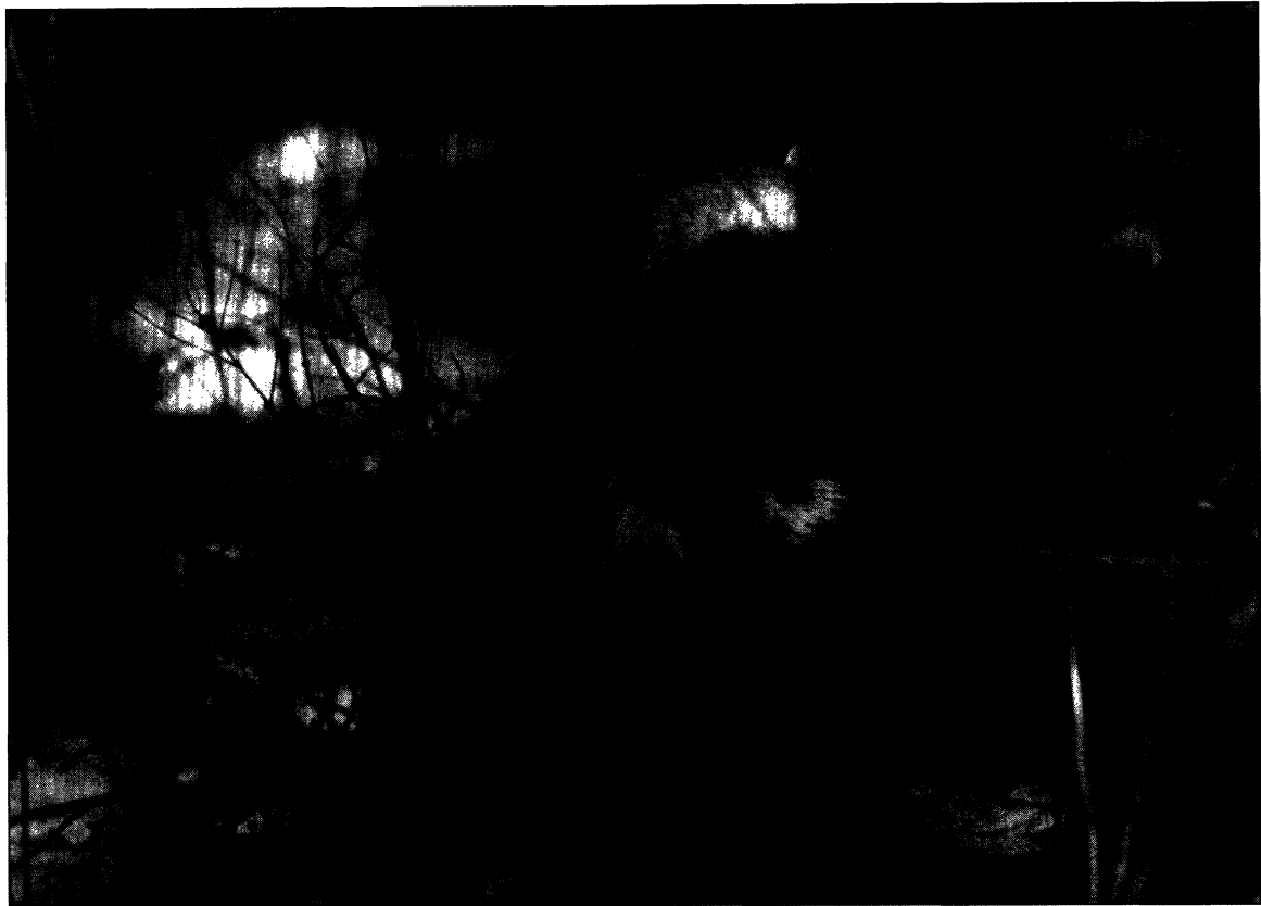
Wolverine ( Gulo gulo )