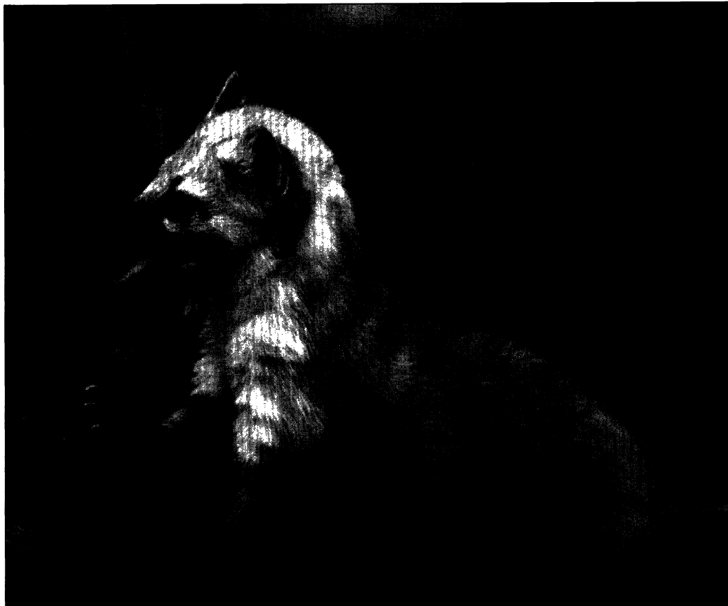
American Marten ( Martes americana )