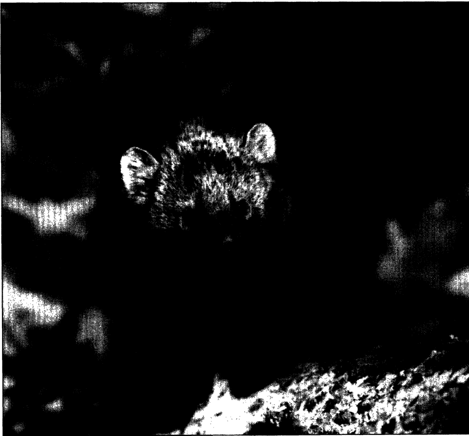
Fisher ( Martes pennanti )