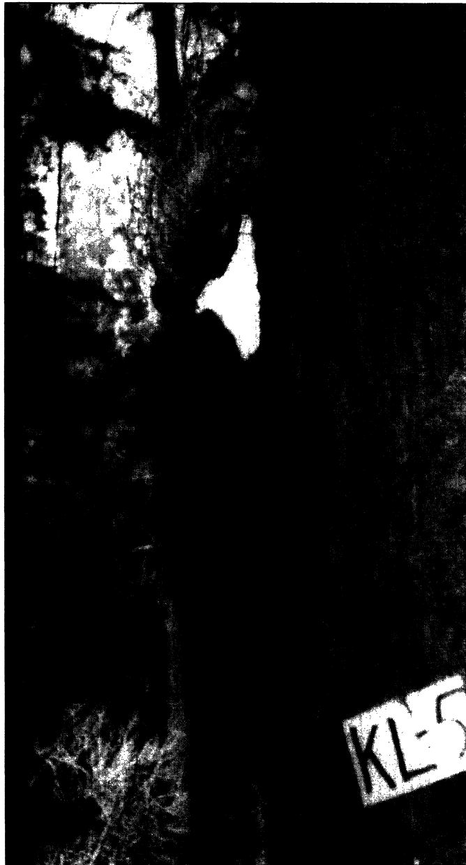
Fisher ( Martes pennanti) photographed using a 35 mm Trailmaster camera at bait station in Klamath National Forest.