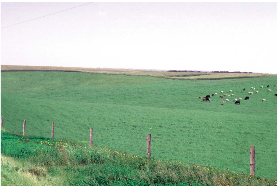
Figure 3. Scenario II landcover emphasizes water quality, as illustrated by extensive perennial grazing cover in Buck Creek (Digital imaging simulation: R. Corry).