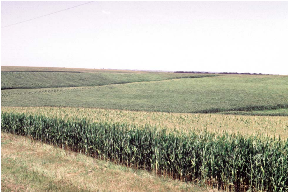
Figure 2. Scenario I emphasizes grain production, as illustrated by monoculture corn/soybean landcover in the rolling landscape of Buck Creek with a roadside in the foreground (Digital imaging simulation: R. Corry).