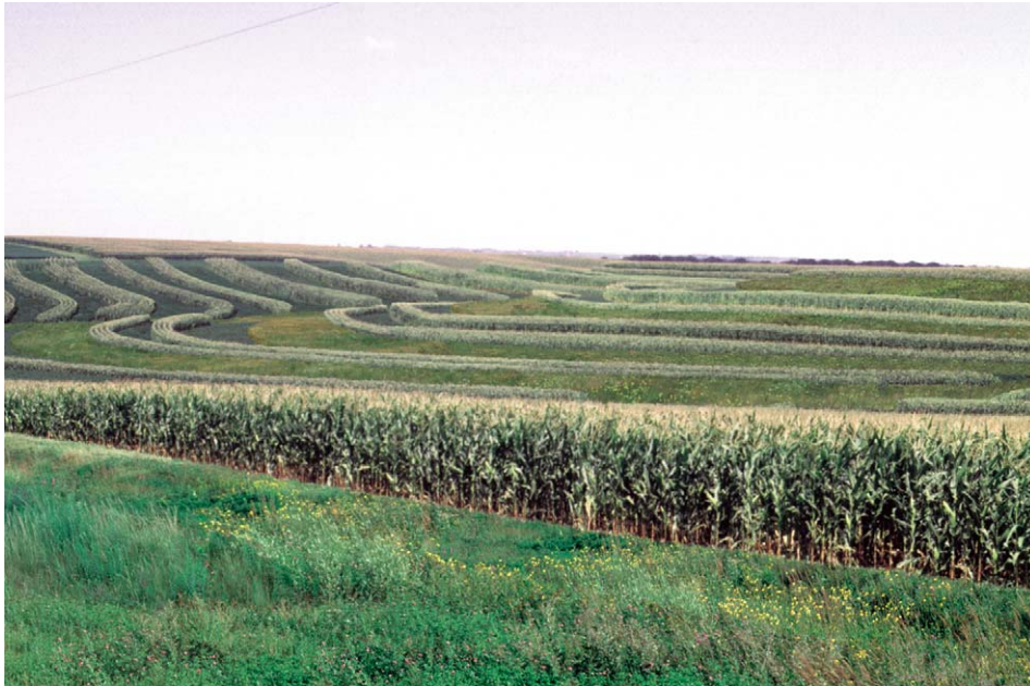
Figure 4. Scenario III landcover emphasizes biodiversity, as illustrated by an innovative strip intercropping pattern of corn, soybeans, and native prairie herbaceous cover in Buck Creek (Digital imaging simulation: R. Corry).