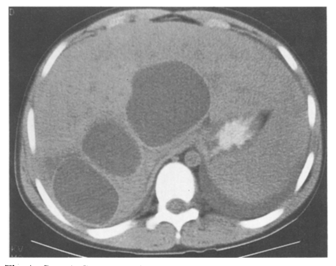
Fig. 1. Case 1. Contrast-enhanced CT shows 3 cysts with highattenuation walls.

Contrast-enhanced computed tomography (CT) obtained postoperatively revealed 3 spherical low-attenuation regions in the liver (Fig. 1). The cysts were well-circumscribed and had a homogeneous internal appearance. No calcification was seen at the margins of the cysts, but high-attenuation rims could be identified in the cyst walls.