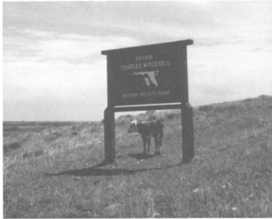
Figure 2. Entrance to the Charles M. Russell National Wildlife Refuge, Montana. (The refuge used to be a “range” and the sign has not yet been changed; photo by Hank Fischer.)

tery, and negotiated sales rather than by competitive bid (Strassmann 1983).