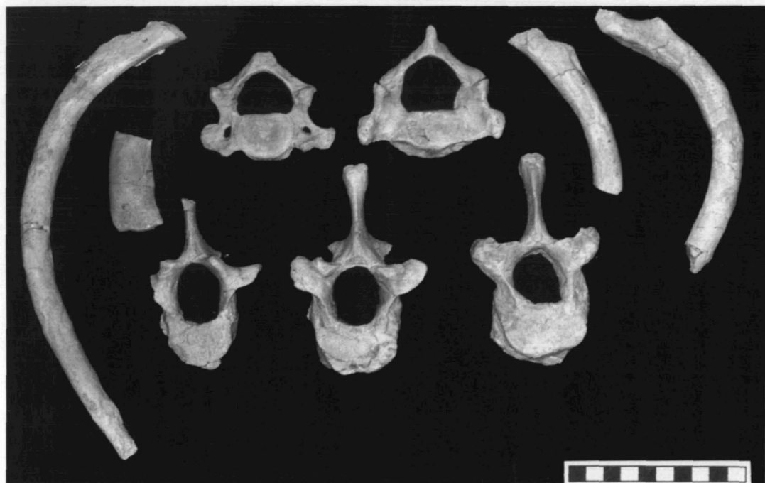
FIG. 4 — Vertebrae and ribs of Protosiren fraasi (SMNS 11090) from the lower Mokattam stage, early middle Eocene of Egypt. Note the rugose articular surface of the capitulum and the reduced tuberculum on the ribs, and the large oval to keyhole-shaped neural canals perforating thoracic vertebrae (bottom row). Scale is in cm.

neural canals that are oval to keyhole-shaped in cross section (seen in anterior or posterior view). Late species of Protosiren have demifacets on the lateral surfaces of the vertebrae for articulation with rib capitula that are deeply excavated and rugose, indicating the presence of a ligamentous or cartilagenous rather than smooth synovial articulation. Similarly, articular facets on rib capitula are relatively flat to concave, with a rugose surface again indicating the presence of a ligamentous or cartilagenous connection rather than development of a smooth bony surface to support a synovial articulation. Sickenberg (1934: p. 88) interpreted these unusual rib articulations in P. fraasi to indicate distinctive respiratory mechanics. P. eoethene described here is more generalized in retaining a synovial component of at least some rib head articulations, and it is probably primitive compared to later Protosiren in this respect. Tubercula on ribs of P. fraasi and P. eoethene are much smaller than those of later Protosiren and this too is probably primitive. The principal characteristic that all species share is the presence of unusually large neural canals.