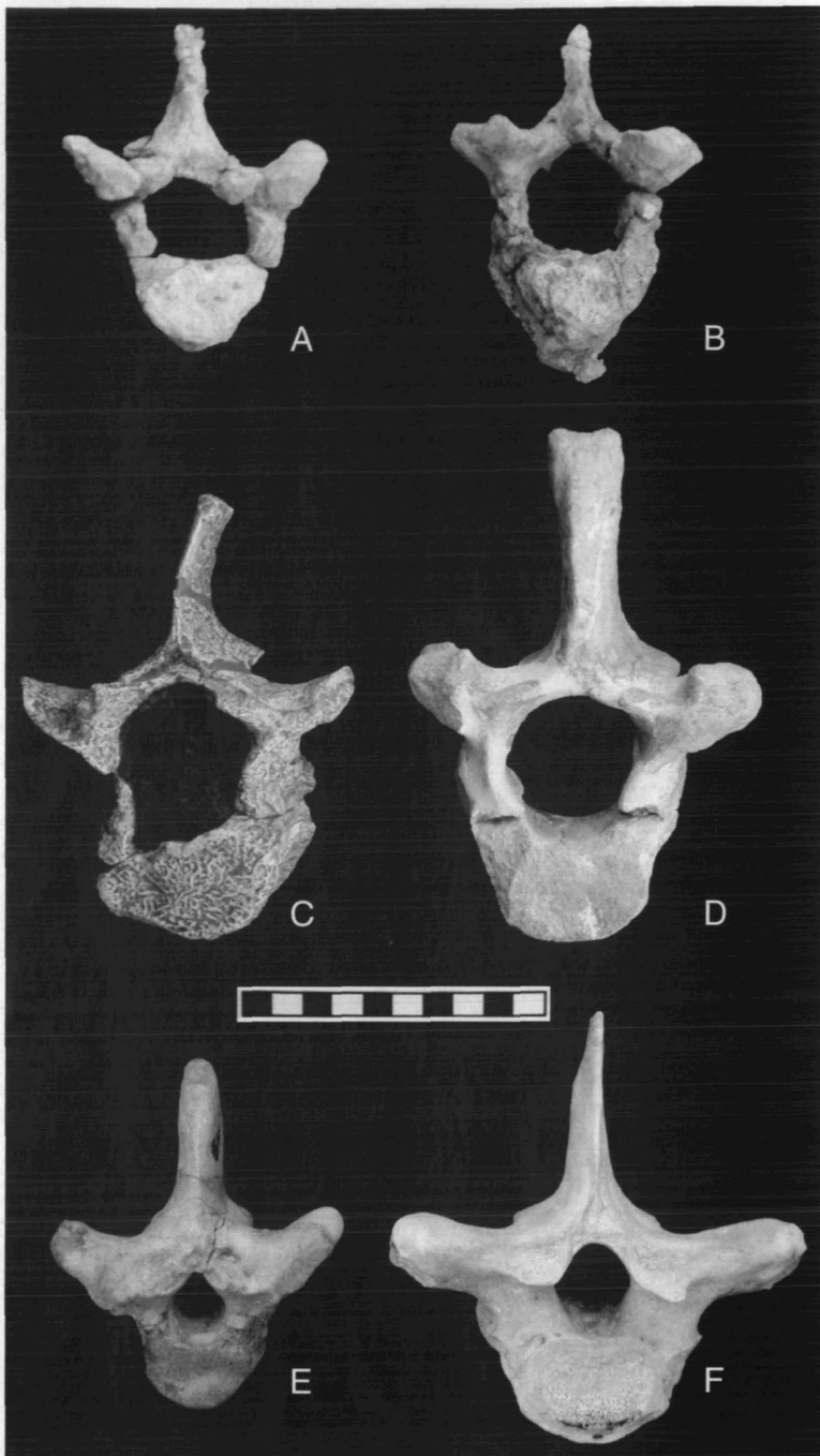
FIG. 2 — Thoracic vertebrae of Protosiren spp. (Protosirenidae), Eosiren sp. (Dugongidae), and Trichechus manatus (Trichechidae). A-B, T3 and T5 of Protosiren eothene from the early middle Eocene of Pakistan (GSP-UM 3487, holotype). C, T12 of Protosiren sattaensis (GSP-UM 3001) from the late middle Eocene of Pakistan. D, T8 of Protosiren smithae (UM 101224) from the latest middle Eocene of Egypt. E, T5 of Eotheroides sp. (UM uncat.) from the latest middle Eocene of Egypt. F, T3 of Trichechus manatus from the Recent of Florida (UMMZ 106206). Note the large vertebral canal with a keyhole-shaped cross section in Protosiren vertebrae. Scale is in cm.