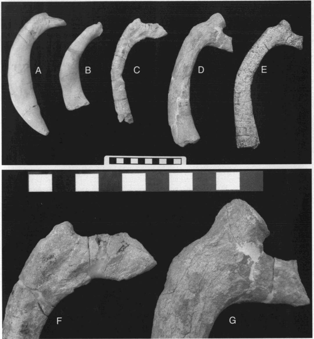
FIG. 3 — Anterior ribs of Eocene sirenians from Pakistan and Egypt. A-B, second and first ribs of Eotheroides sp. (UM uncat.) from the latest middle Eocene of Egypt. C, first right rib of Protosiren eoethene (GSP-UM 3487; holotype) from the early middle Eocene of Pakistan. D, first right rib of the Egyptian Protosiren smithae (UM 101224) from the latest middle Eocene of Egypt. E, first right rib of Protosiren sattaensis (GSP-UM 3001) from the late middle Eocene of Pakistan. F-G, enlarged views of the proximal ends of the head of the first rib of Protosiren eoethene (GSP-UM 3487, holotype) from the Eocene of Pakistan and Protosiren smithae (UM 101224) from the latest middle Eocene of Egypt. Note the lack of well-formed joint surfaces on articular processes of both ribs. Scales are in cm.

the large oval to keyhole-shaped cross section typical of Protosiren . Zygapophyses are developed high on the neural arch, and metapophyses are prominent. Neural spines are gracile and not nearly so robust as those in some later Protosiren . Demifacets for rib articulations are again poorly