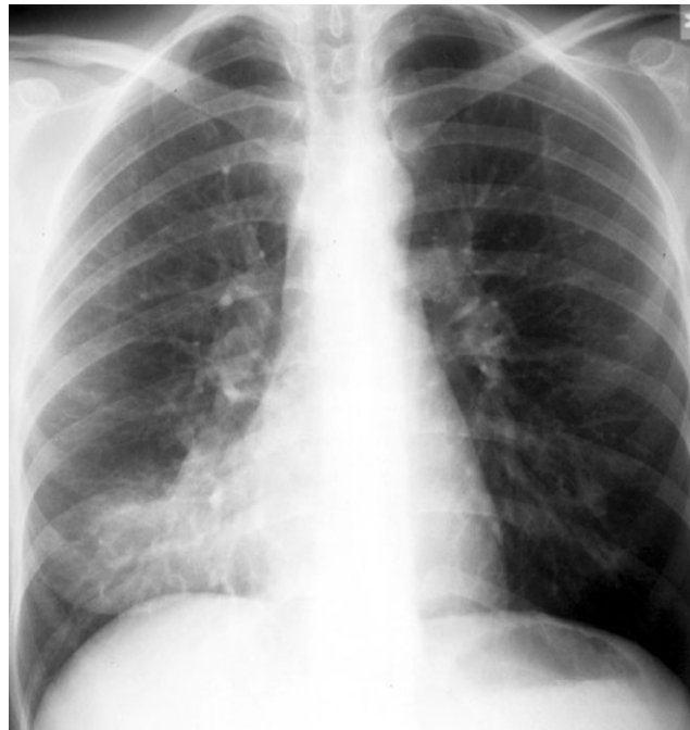
FIGURE 1. Chest radiograph of right middle lobe infiltrate in a patient with CAP.

The diagnosis of community-acquired pneumonia requires that a patient have both signs and symptoms consistent with pulmonary infection and evidence of a new radiographic infiltrate. Therefore, most guidelines recommend that all patients with a