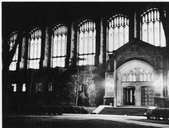
The Legal Research Building on a spring evening is a center of activity at the Law Quadrangle. This view shows the main entrance, which faces the Lawyers Club across the quadrangle. Copies of this print are available for $1.50 from University Information Services, 3528 Administration Building (please make checks payable to The University of Michigan).

The Case Clubs ask the help of alumni and friends of the