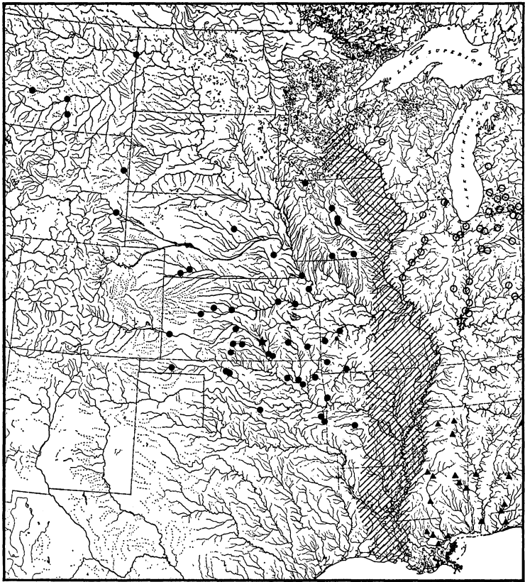
MAP 1. Distribution of Amyda spinifera hartwegi . Solid circles indicate localities from which specimens have been examined; the type locality is designated by a solid star. The crosshatching delineates (1) the approximate area of intergradation between hartwegi and spinifera (based on material seen by the authors), and (2) the region in Louisiana, Mississippi, and Arkansas where there is an extremely complex population of soft-shelled turtles that exhibits characteristics of the three subspecies, hartwegi , spinifera , and aspera .

Localities for Amyda spinifera spinifera are indicated by hollow circles; the type locality for this race is designated by a hollow star.