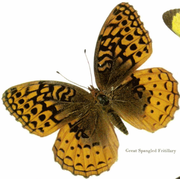
Great Spangled Fritillary