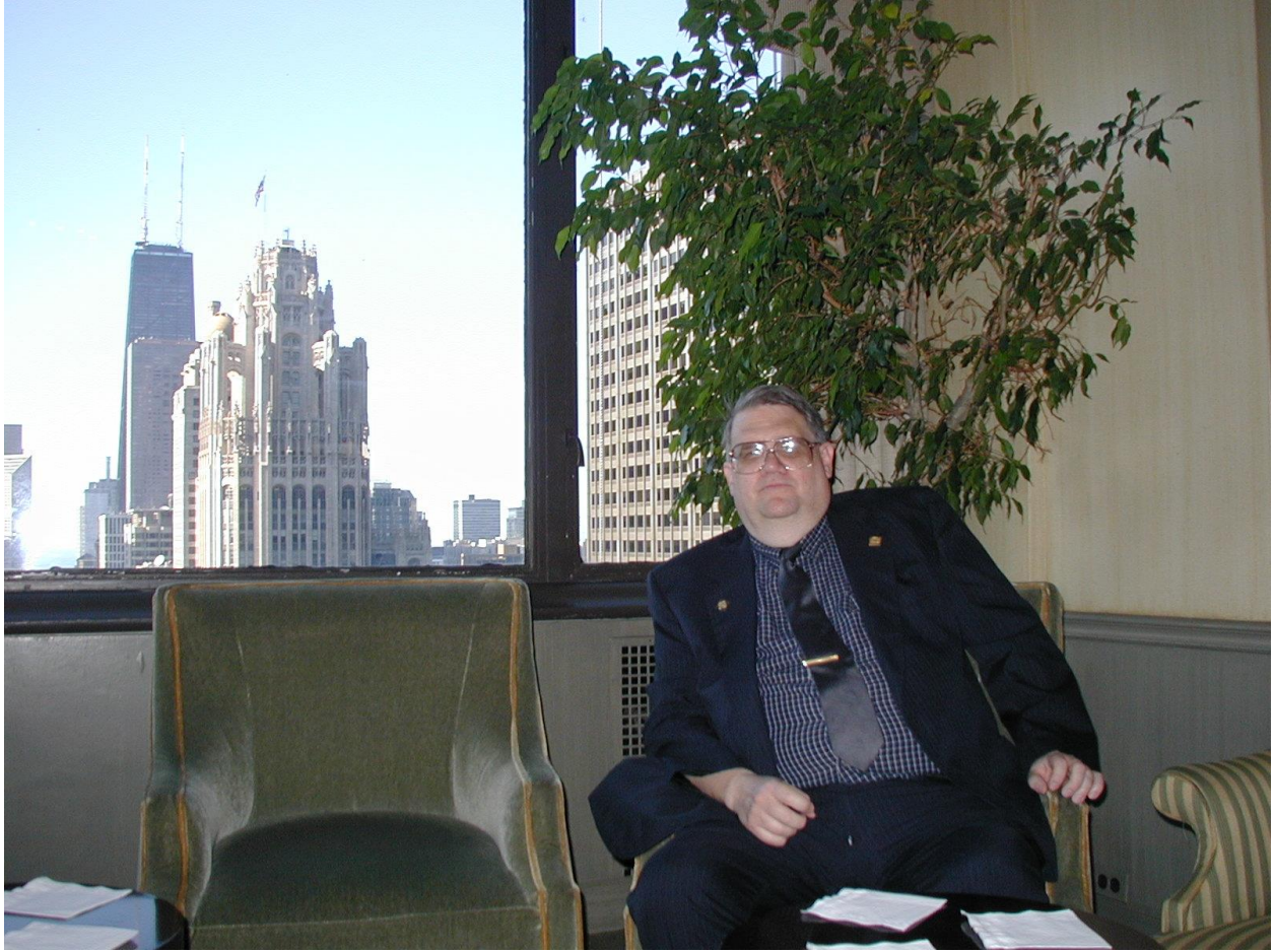
Enjoying beverages in advance of viewing the juried art.