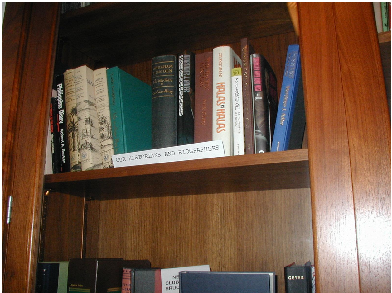
Donald's books; Alma's art.