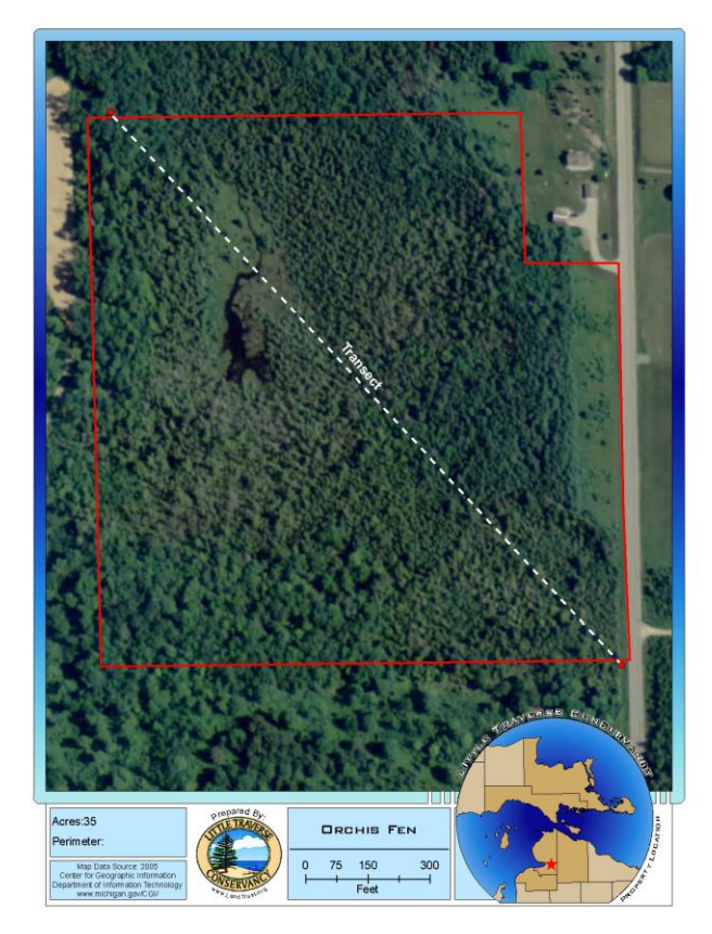
Figure 1. Orchis Fen Preserve in Emmet County, Michigan, showing the sampling transects line.

The transect was 569 meters long by two meters wide. On July 28, 2008 the class went out in three groups. Each group identified plants along one-third of the transect. Plants located outside of the transect were identified as we encountered them to provide a better representation of the overall floral composition in the preserve. We collected specimens that could not be identified in the field and took them back to the University of Michigan Biological Station laboratory. We keyed out these unknown plants using Michigan Flora Volumes I, II, and III (Voss 1979, 1985, 1996), the Manual of Vascular Plants of Northeastern United States and Adjacent Canada (Gleason and Cronquist 1991), the Illustrated Companion to Gleason and Cronquist's Manual (Holmgren et al. 1998) and the comprehensive herbarium collection located at the University of Michigan Biological Station.