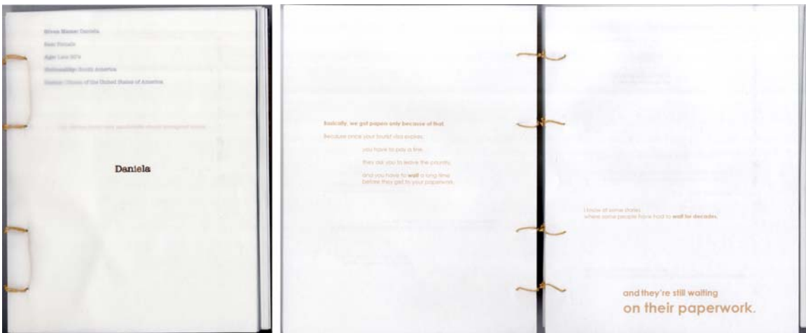
(cover and spread from Daniela's book)