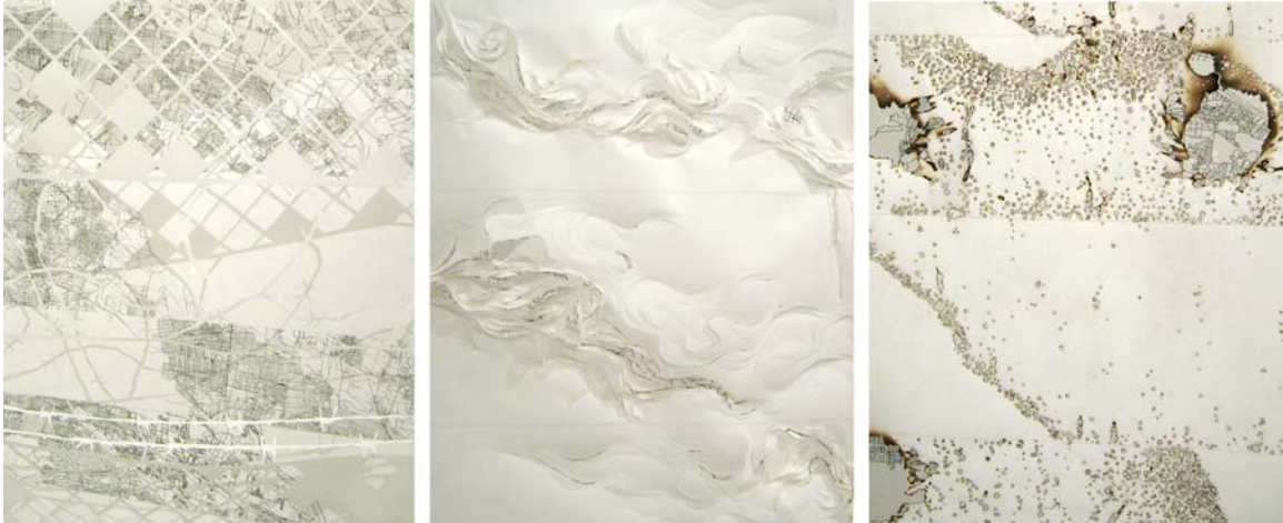
(details from each set of drawings)

because they are recognizable and allude to geographical data. I used maps from Juárez, Mexico and El Paso, Texas since more migrants pass through these two cities than any other immigration point in the world. If the migrant in the corresponding book traveled between Mexico and the United States frequently, the order of the maps sections also alternated between the two countries. The maps in each piece are drawn to coincide with the migrants' stories.