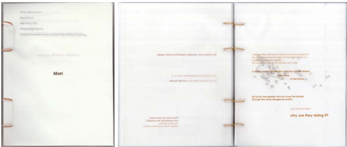
(cover and spread from Mari's book)