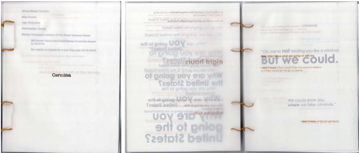
(cover and spread from Carmina's book)