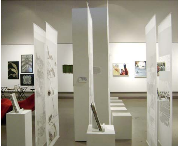
(side view of installation)

The drawings are large and grab the viewer's attention. In total, I have six pieces of vellum, each six feet long by three feet wide. The vellum pieces are grouped into sets of two, accompanied by a book on a migrant. In each set, the vellum sheets are hung parallel to one another, with only eight inches between each piece to create layers. The sets are hung parallel to one another as well, with space between each set to allow viewers to walk around them. The positions of the large drawings separate the gallery space like a maze, creating physical borders that people will navigate through. I want the audience to experience the presence of tangible borders to begin questioning what it feels like to be on one side versus the other.