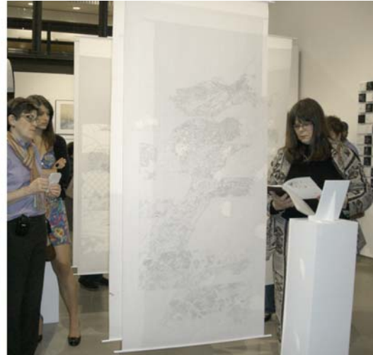
(gallery viewers interacting with installation)

In addition to creating the physical experience of walls, I play with what viewers can see through borders. Since I drew on semi-transparent vellum, the viewer can see through the paper at varying degrees. I want to address intangible borders along with the physical. Since the paper itself is a thin border that barely exists, it serves as a metaphor for both types of borders. At first, viewers may think that they can see through all the pieces at once due to the semi-transparency of the vellum, but it is only with closer inspection that one can see the subtle differences that occur in each piece itself. The relationship between America and Mexico is complicated, and it requires a close look to begin understanding all of its components.