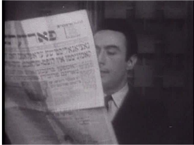
Figure 2.2. Lenny Bruce using the Forverts as a prop on "The Steve Allen Show."

audience roared. 215 His implication was, of course, that in Jewish circles, his art met no resistance—an exaggeration, certainly, but not one without a hint of truth to it.