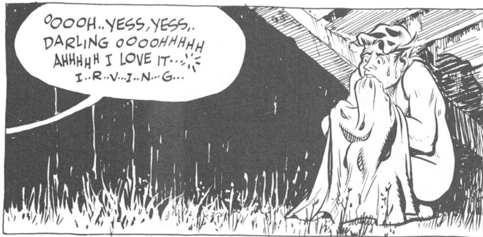
Figure 5.7. Detail from Contract (164).

from the bushes witness Benny's attempted rape—not only a brutal and criminal act, but one that does not achieve sexual fruition (seeing as how Benny "didn't even penetrate"). Though they are thrilled for having indeed witnessed something "dirty," the spectacle does not inspire them to further their own sexual exploration, and it is not clear that they even understand what they have seen (172). Even more powerfully, after Willie's premature ejaculation, Missis Minkis's husband Irving appears, slaps her twice in the face, and then the couple proceeds to copulate enthusiastically while a stunned Willie, naked but for a blanket, looks on in wide-eyed terror (see figure 5.7). Far from the sexual pleasure that Willie hoped to enjoy, he sustains a lasting trauma: he bites down on a blanket to silence himself as he watches their sexual display. And his silence is permanent: he never speaks again in the story, which ends with him isolated on the fire escape of his family's apartment (179-80). Especially considering Eisner's acknowledgment that "Willie's story ... is essentially autobiographical" (xix), this scene can be read as dramatizing Eisner's deep unease with the pervasive display of graphic sexuality that he would encounter in 1960s and 1970s culture.