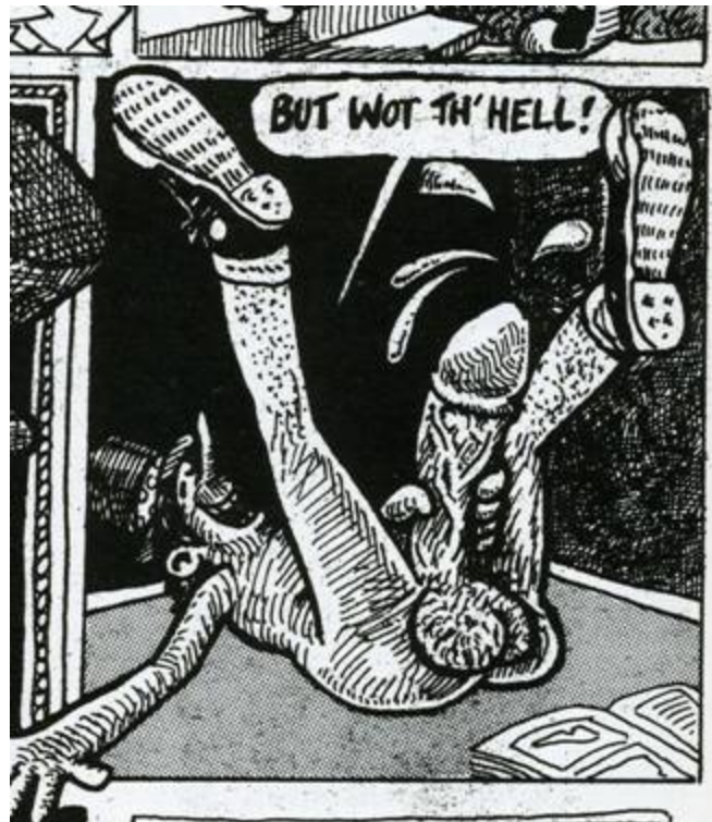
Figure 5.2. Detail from Art Spiegelman, "Jolly Jack Jack-Off," Gothic Blimp Works #7 (1969). Reprinted in Rosenkranz, 104.