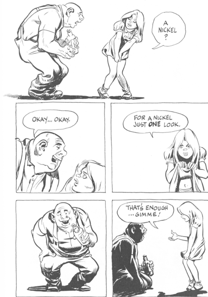
Figure 5.6. Detail from Contract (111).

A similar dynamic obtains in "Cookalein," in which one of Eisner's youngest characters asks another, "Wanna watch the grown-ups doin' dirty things?" (167), one of the clearest references to Eisner's concern with the relations between children, adults, and obscenity. Throughout "Cookalein," the spectators of " dirty things" encounter highly disturbing images rather than the erotic or arousing ones they may expect. Instead of a titillating display of adult coupling, the two young children who spy on "grown-ups"