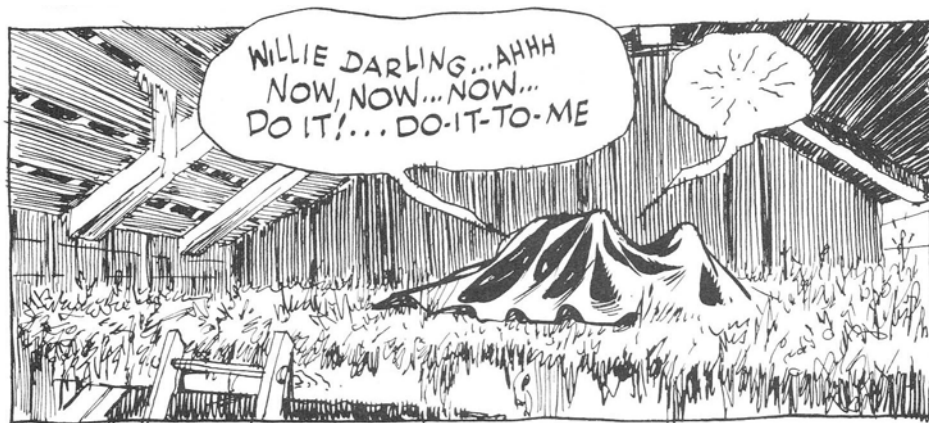
Figure 5.3. Detail from Will Eisner, A Contract with God (161).

19, is seduced by a married woman, Missis Minkis, their coupling ends abruptly before it has begun; Willie's premature ejaculation is represented in an abstract but evocative dialogue bubble containing a set of weakly wavering lines, and he has to admit his inexperience (see figure 5.3). In another plotline, a young couple named Benny and Goldie court while pretending to be a "rich manufacturer" (148) and an heiress "from the dress business" (150), respectively. It is while petting in the woods that they discover that neither one of them has any money. Benny then attempts to rape Goldie, tearing her clothes—but even this violent attempt for sexual satisfaction fails: Herbie, a medical student who cares for Goldie after the incident, informs Benny that he "didn't even penetrate" and that he is "sick ... I mean, sexually" (175). Throughout Contract sexual desire—adulterous, violent, and based on deception—leads to disappointment and disaster rather than fruition or satisfaction.