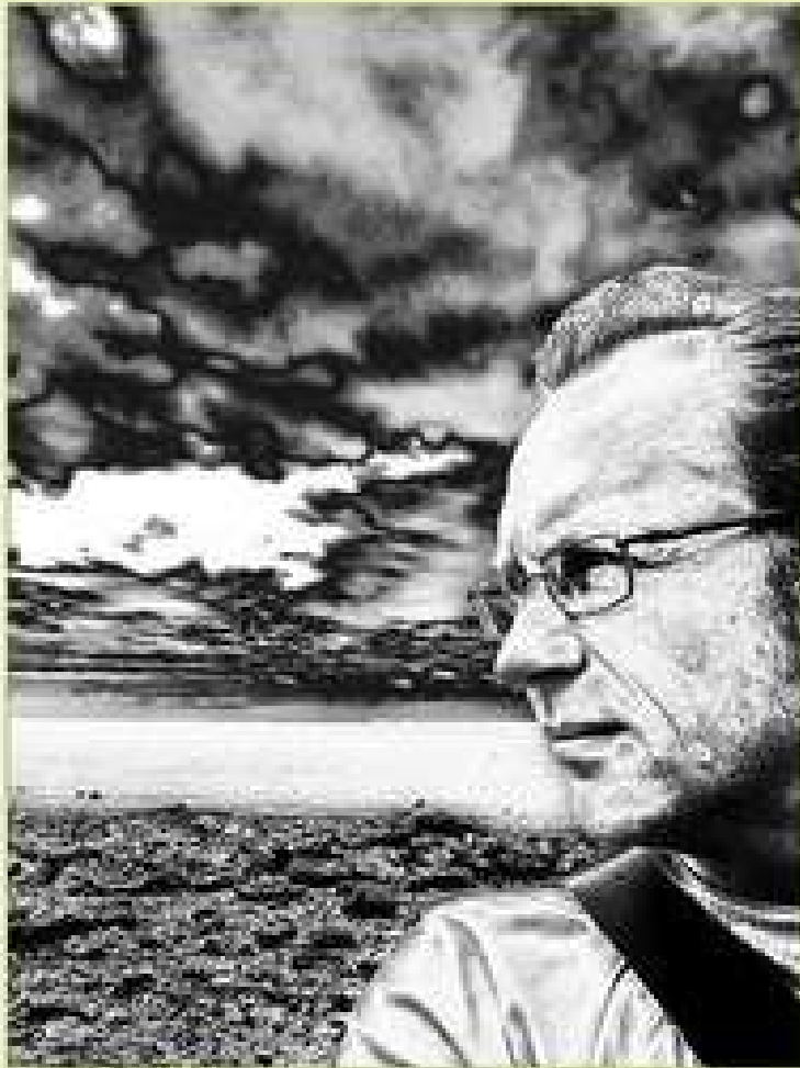
'gone to stone'

"I feel tools such as Creative Commons are part of the discussion we should be having about our lives, how we live, how and what we learn and the mechanisms required to support innovation and creativity, that which sustains life, gives it meaning and purpose - a lifetime of learning rather than a lifetime of uncertainty."