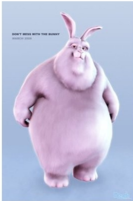
Big Buck Bunny Poster by Blender Foundation http://creativecommons.org/licenses/by/3.0/

"If you give away cool stuff, what you get in return is always more!" — Ton Roosendaal