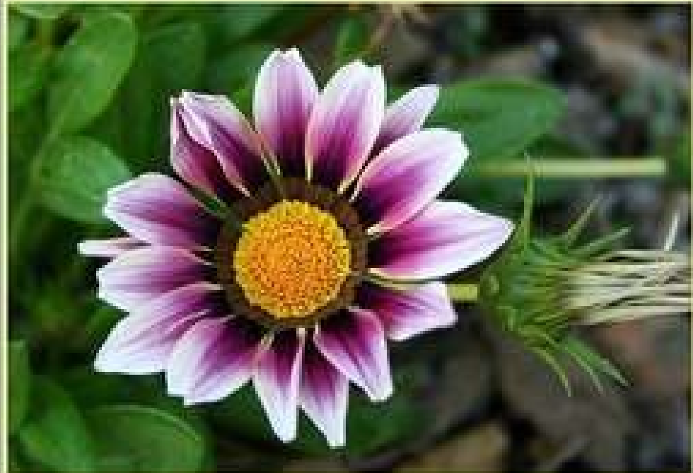
'there are really no rules'

"The Creative Commons license is a perfect example of the sort of copyright changes the modern world needs to come to grips with in the digital age; information should be free to all." – John Harvey, monkeye.net, Flickr photographer