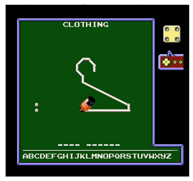
Figure 5. The Anticipation game

For the second task, the party game Catch Phrase was modified to be played over IM. In this game, participants were given a list of common words and short phrases which were taken from a commercially available version of the game. Each partner had a different set of words. The objective of the game is to have one's partner guess each word from the list. To do this, a participant may say anything about the word or phrase they want without explicitly using the word or any part of it. Participants would check each word off the list as soon as their partner correctly guessed it. Participants could go through the list in any order they preferred, and dyads were free to coordinate their turn-taking however they wished. Each participant's score on this task was the sum of the words they correctly guessed and the words their partner guessed.