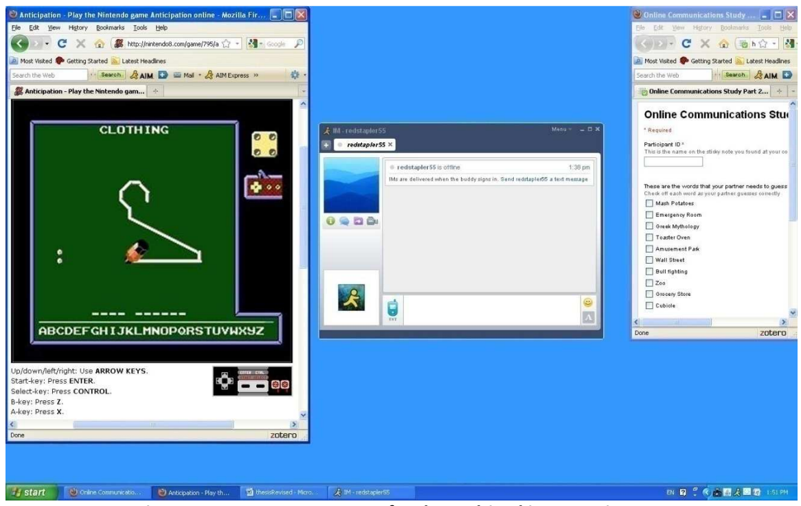
Figure 6. Screen arrangement for the multitasking experiment.

The AIM client was placed at the center of the screen, with the list of words for catch phrase to the right and the Anticipation window to the left. 27" monitors were used at a resolution of 1920x1200, which enabled all windows to be displayed at the same time without interference. The experimental session lasted 15 minutes. Figure 6 shows the screen arrangement for the task.