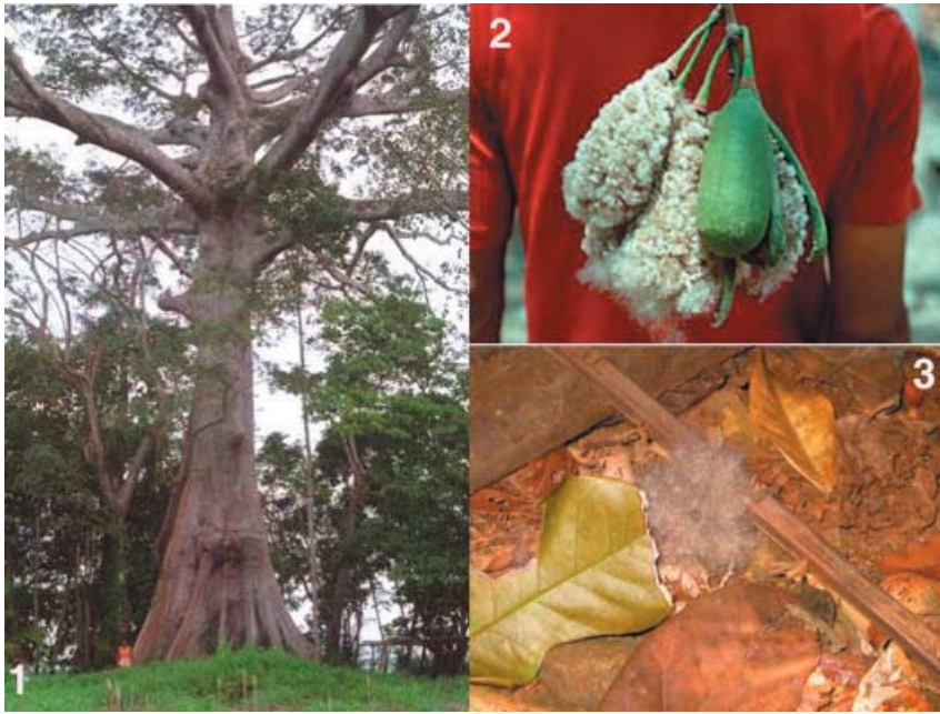
Fig. 1 Ceiba pentandra clockwise from left (1) emergent Amazon tree with a person beside the characteristic buttress trunk; (2) dehiscent fruit with kapok; (3) seed enveloped in kapok.