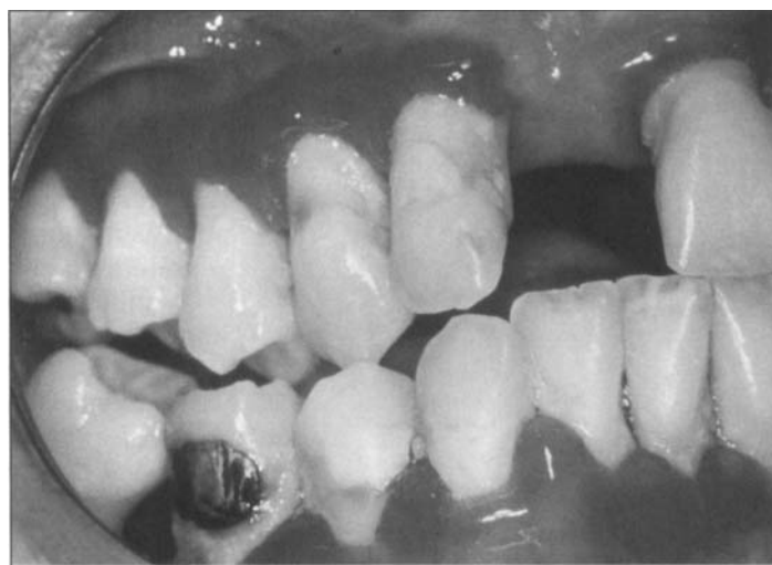
Fig 2. Periodontal breakdown.