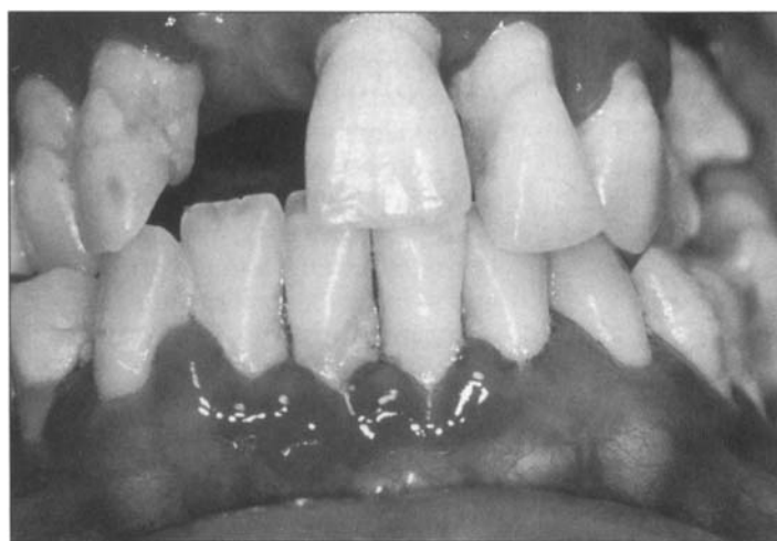
Fig 1. Gingival recession, erythematous and edematous tissues, plaque accumulation.

At age 5, her only remaining teeth were the maxillary right second molar and the canines. Bone loss was uniform, and the family was counseled about the poor prognosis for retaining her permanent dentition. At 6 years of age, the maxillary left permanent first molar was removed, and root caries was noted on both mandibular first molars. Despite repeated counseling, oral hygiene was not optimal at most visits, with the gingival tissues consistently appearing erythematous, edematous, and bleeding on contact. In November of 1998, clinical and radiographic examinations revealed poor oral hygiene, generalized periodontal breakdown with pocket formation, gingival recession, moderate to severe mobility of all teeth, severe bone loss, and caries (Figs. 1-3). Complete exodontia was performed uneventfully while the patient was under intravenous sedation with midazolam hydrochloride and ketorolac tromethamine. Before the procedure, her blood values were WBC = 9900/mm 3 , hemoglobin = 11.4 g/dl, hematocrit = 33.8%, platelets = 200,000/mm 3 , and ANC = 2.2. She was prescribed clindamycin for 10 days, 0.12% chlorhexidine rinses twice daily for a week, and ketorolac tromethamine for 5 days. After adequate tissue healing, complete