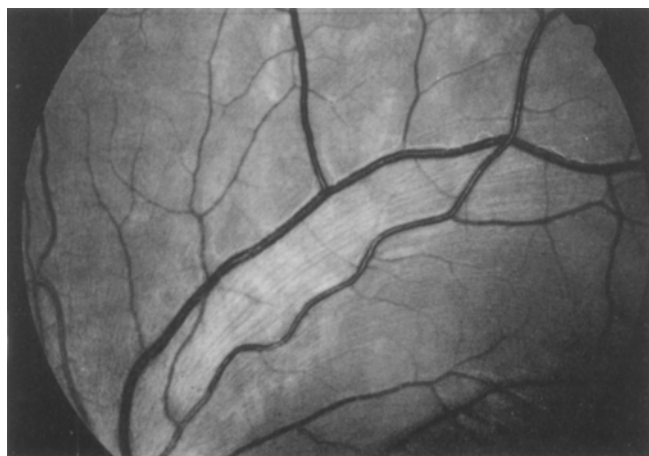
Fig. 3. Superior temporal quadrant of a left fundus showing several slit defects in the retinal nerve fiber layer.

Findings by observer 1 (both masked readings), observer 2, (single masked reading) and observer 1 (unmasked reading) are shown in Table 1. Odds ratios for unmasked observations range from 4.1 to 11.2. Observer 2 did not see a significant difference between Alzheimer's patients and normal subjects. However, review of all available photographs from both Alzheimer's patients