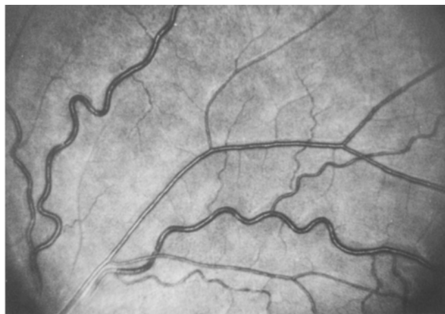
Fig. 2. Superior temporal quadrant of a left fundus showing diffuse loss of the retinal nerve fiber layer with exposure of blood vessels.

nerve fiber layer throughout the photograph (Fig. 2). Slit defects were identified as dark lines running parallel to normal nerve fiber striations extending from the optic disc for a distance of at least 2 optic disc diameters (Fig. 3). Wedge defects were determined as slit defects greater than the width of a large vein (200 microns).