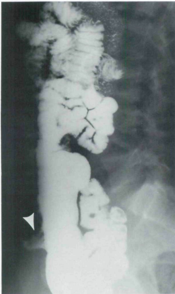
FIG. 2. Lateral 45-min small bowel follow-through film again showing a double contrast image of the Meckel's diverticulum ( arrowhead ). The antimesenteric projection of this diverticulum is clearly demonstrated.