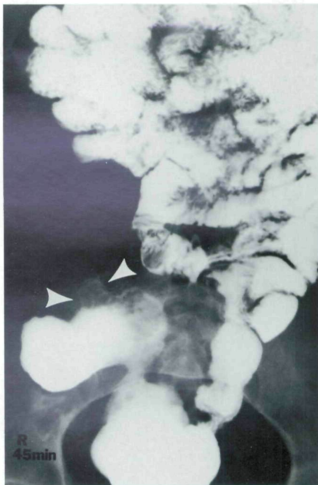
FIG. 1. Anterior-posterior 45-min small bowel follow-through film demonstrating a dilated, edematous segment of ileum with a double contrast image of the Meckel's diverticulum (arrowheads).

A technetium 99^m pertechnetate Meckel's scan performed the following day was negative. Total colonoscopy revealed no pathological lesions. Old blood was visible up to the level of the ileocecal valve. A subsequent pentagastrin stimulated Meckel's scan was also negative. On a barium small bowel follow-through, an abnormally dilated loop of bowel was seen approximately 15 cm proximal to the ileocecal valve (Fig. 1).