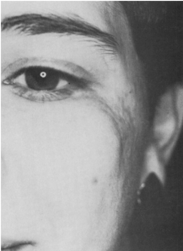
FIGURE 1. Pre-Zyderm implant.

The presence of autoimmune connective tissue disease (CTD) is an absolute contraindication to the administration of ZCI. The diagnosis of one of these diseases is made through history, serologic testing, x-rays, and other diagnostic procedures. Patients with the variant en Coup de Sabre of linear scleroderma have frequently been found to have positive ANA as well as other signs and symptoms of CTD. 3,4 Our patient, by history, physical examination, and laboratory findings, did not fit this subset of scleroderma. Her disease was inactive, her physical examination was entirely normal, and her ANA was negative. For these reasons, we thought she had localized morphea only, with no predisposition to systemic disease. Serologic testing for anti-ZCI antibodies was also negative. To date, this highly specific test for anti-ZCI antibodies had been found positive in about 7% of the control population and 100% of patients who have received ZCI and exhibited a positive skin test or treatment site reaction. 5 It is entirely possible that this assay can be used to screen patients at risk to develop adverse ZCI reactions. In doing so, the list of contraindicated diseases may be modified to allow more patients to receive ZCI.