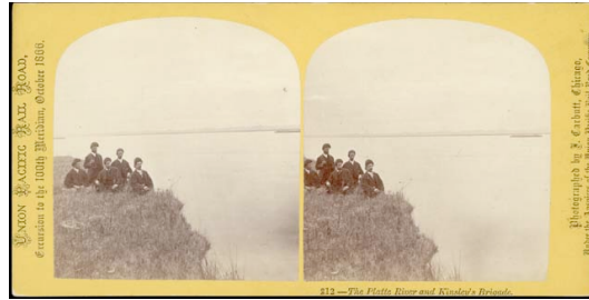
Fig. 6a. John Carbutt, “Platte River and Kinsley’s Brigade Graphic, 1866. Stereograph, albumen ; 9 x 18 cm. (3 1/2 x 7 in.). Denver Public Library, Western History and Genealogy. Z-3307. http://photoswest.org/cgi-bin/imager?11003307+Z-3307