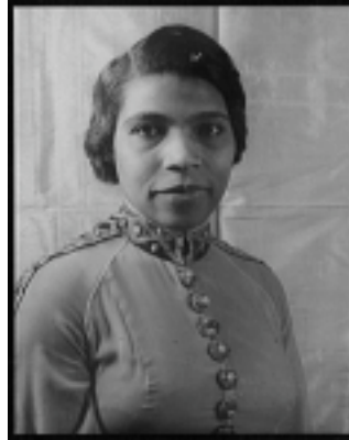
Fig. 4. Carl Van Vechten, "Portrait of Marian Anderson," 1940. Gelatin silver print. Copy from black and white copy negative. Library of Congress, American Memory, Creative American, Portraits by Carl Van Vechten. cph 3c05575 http://hdl.loc.gov/loc.pnp/cph.3c05575

These four examples begin to show that the creation of a general-purpose collection of digitized photographs is a complex, multifaceted process where technological tools, source characteristics, and the often unexpressed goals of the collection interact at every step of the process. 28 The four major steps include the identification and selection of photographs, digitization, indexing at the item level, and website development to support online searching, browsing, display, and other functions. Each of these steps is complex and time consuming. Each of these steps involves a significant variety of decision making – processes that are increasingly well articulated in digitization guidelines.