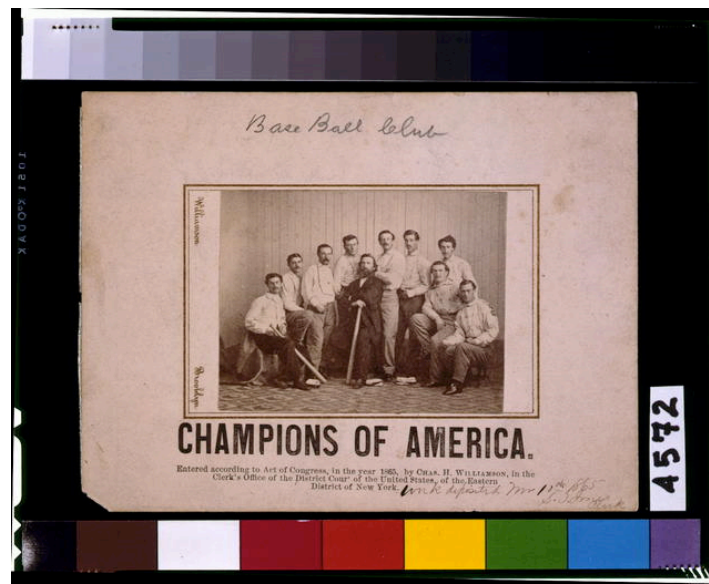
Fig. 2. C. H. Williamson, “Champions of America,” c1865. Color film copy transparency. Library of Congress Prints and Photographs Division Washington, D.C. 20540 USA. cph 3g04572 http://hdl.loc.gov/loc.pnp/cph.3g04572

3. The photographer’s intent is rendered.