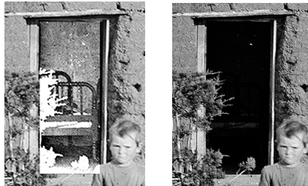
Fig. 5. Solomon D. Butcher, “Unidentified family near West Union, Nebraska, 1886. Glass plate negative (dimensions) and detail with adjustment to high density segment of doorway. Omaha, Nebraska State Historical Society.