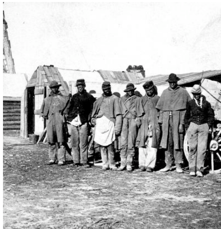
Fig. 6b. “Afro-American Army Teamsters,” ca. 1861-1865. Stereoview, (dimensions not specified).