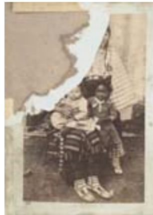
Fig. 1. W. J. Carpenter, “Ute Family,” 1890. Albumen print; 25 x 17 cm. (10 x 7 in.) mounted on cardboard album page. Denver Public Library, Western History and Genealogy. CHS.X9291. http://photoswest.org/cgi-bin/imager?20009291+CHS.X9291