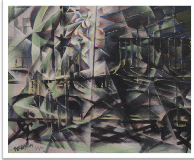
Giacomo Balla, Speeding Automobile , 1912. Oil on wood, 21 7/8 X 27 1/8 in. Museum of Modern Art, New York.