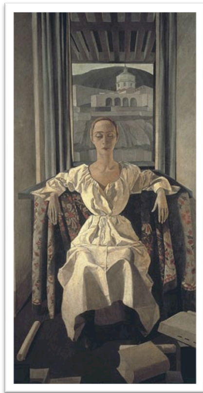
Felice Casorati, Silvana Cenni , 1922. Oil on canvas, 205 X 105 cm. Museo d'Arte della Citta, Ravenna, Italy.