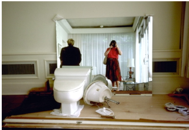
And look what I found on the dining porch!