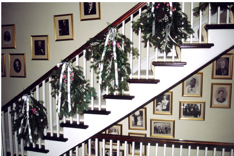
Some of the many photographs of earlier Michigan presidents and their families that we framed and displayed throughout the house (shown at Christmas time in the President's House)

It was a unique experience living in a house characterized by such an extraordinary history. It is quite a challenge to make such a landmark a home for your family, especially since you know that you are only visiting for the brief time that you are in the presidency.