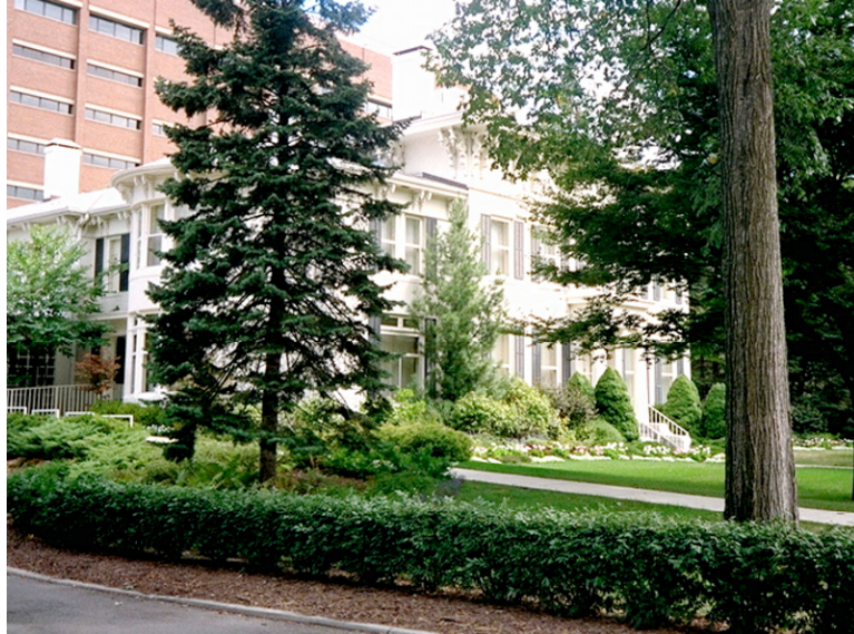
My first view of the President's House in 1969, glowing in the distance as the University's White House