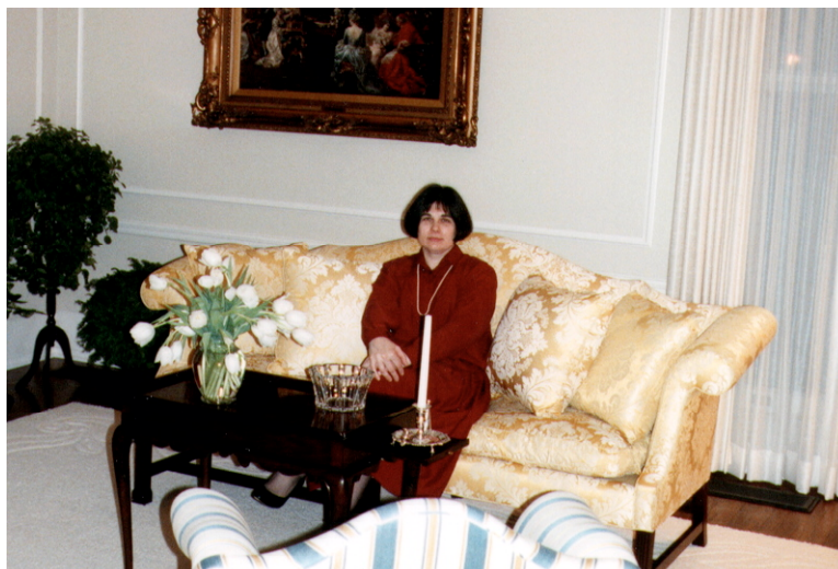
Finished at last!