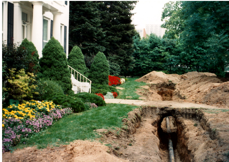
The front yard was not much better ...