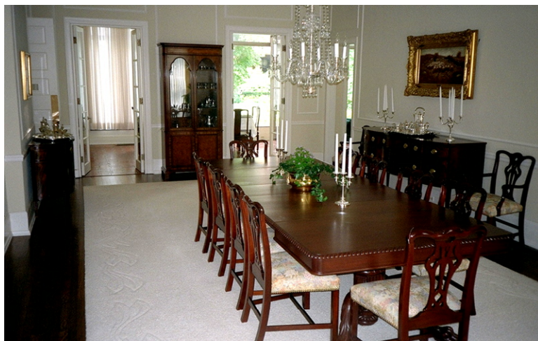
We repaired, replastered, and painted the walls.

The drapes had been in place for many years. They were also water and sun damaged and needed to be replaced, again within budget. The renovation was completed during the summer, but it took several months before the drapes, furniture and rugs arrived. Through careful budget control and considerable effort, we were able to refurbish the entire house with the money that was going to be spent to replace the turquoise carpet.