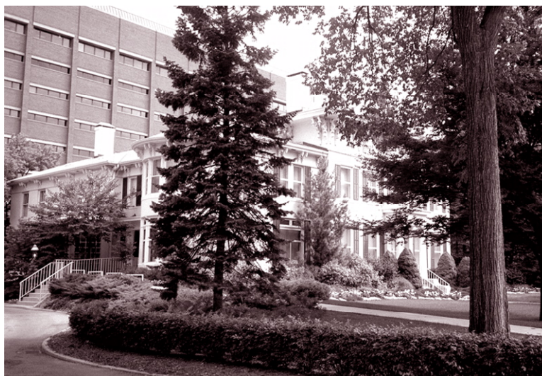
The Hatcher Library looming behind the President's House