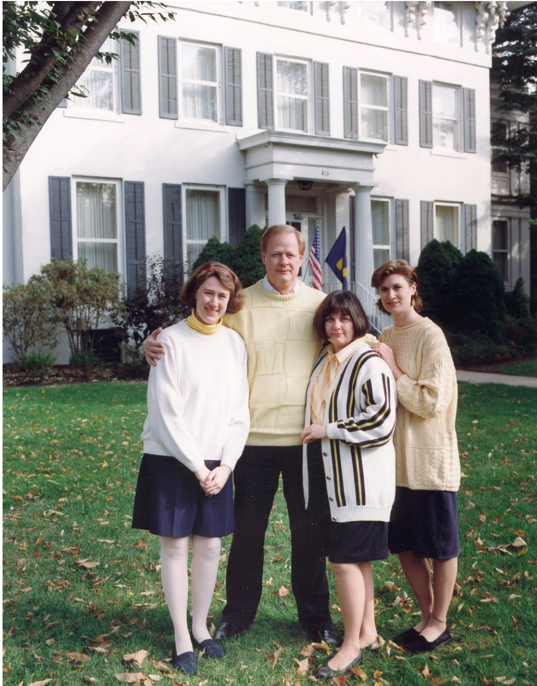
The First Family of the University of Michigan 1988-1996