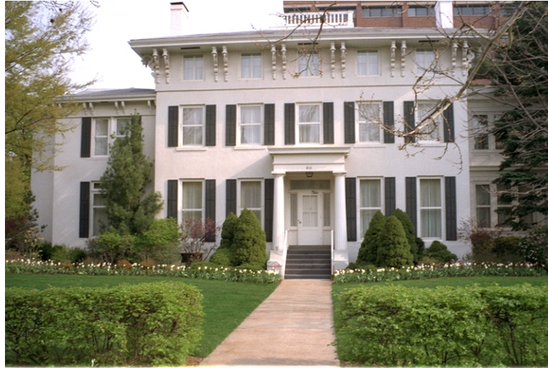
The President's House during the Shapiro years

With the help of Virginia Denham, all of the Shapiro's furniture was moved over to furnish the upstairs of the President's House and to fill in the downstairs. The house was left essentially intact. The carpets and drapes remained. The only changes were to replace the old wallpaper in the dining room which was very old and reupholster the dining room chairs. Some changes were also made in the master bedroom since pictures had been removed from the walls and some painting was necessary.