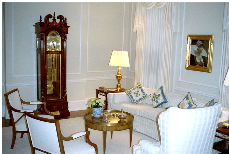
We decorated the house with art on loan from the Museum of Art

The drapes had been in place for many years. They were also water and sun damaged and needed to be replaced, again within budget. The renovation was completed during the summer, but it took several months before the drapes, furniture and rugs arrived. Through careful budget control and considerable effort, we were able to refurbish the entire house with the money that was going to be spent to replace the turquoise carpet.