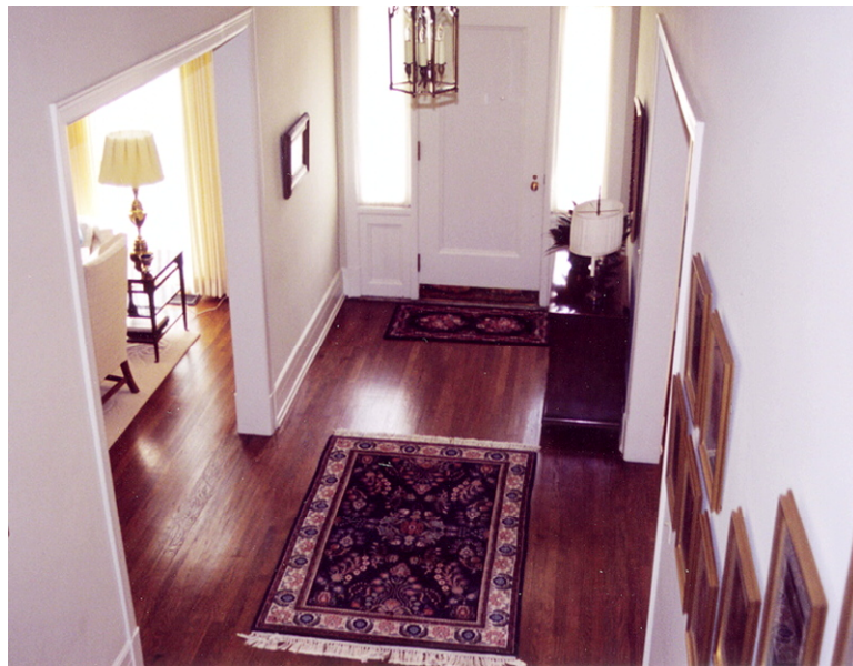
The original floors of quarter-sawed oak were exposed and refinished

We began by removing the carpets from all of the floors on the first and second floors. All of the floors were wood. The library and the dining room were the original quarter-sawed oak and were in beautiful condition. Of course there was some damage done when removing the old radiators along with some water damage, but this could easily be repaired. The living room was not quarter-sawed oak, but was beautiful none the less. The president's study was a wide board pegged wood with a little water damage, but repairable. The second floor wood was not as grand but in satisfactory condition for refinishing. The carpet on the third floor was in good condition, and we decided to leave it in place.