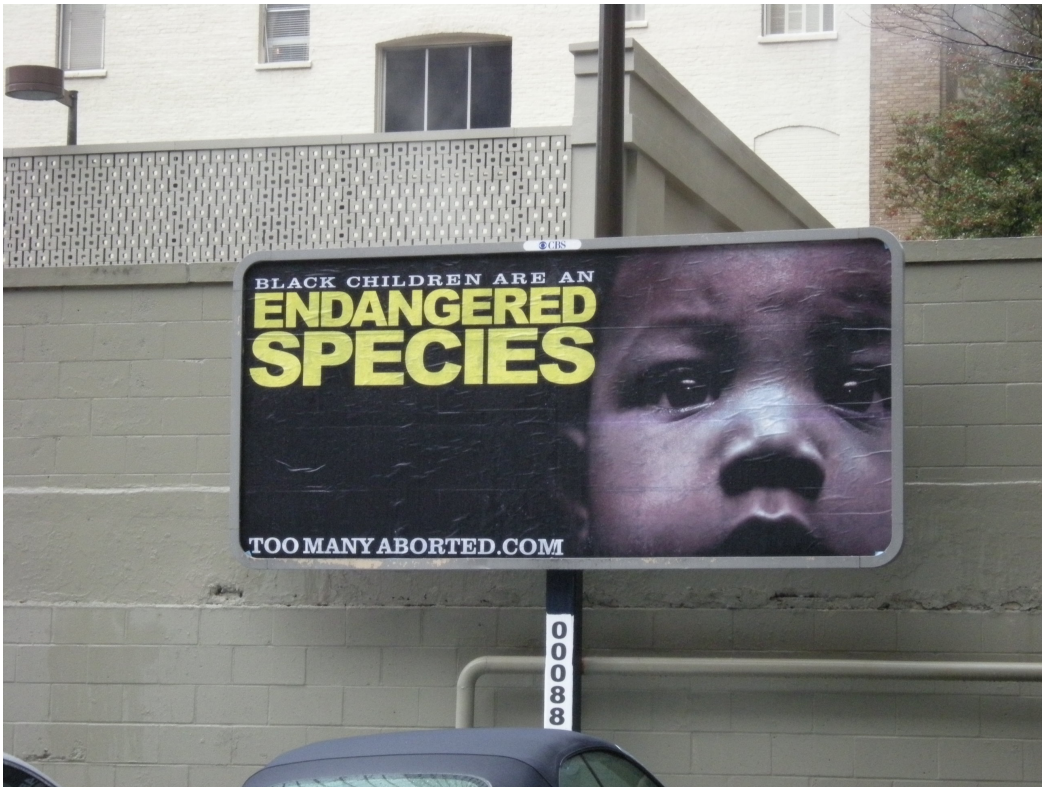
Figure 1: Endangered Species billboard in an Atlanta parking lot (February 2010)

As discussed in the introduction, social movements in the US often look to the US Civil Rights movement for inspiration in terms of argument, strategy, and tactics. The pro-life movement is no exception, but this case was distinct as these were pro-life African Americans who were invoking the Civil Rights movement as a way to demonstrate their racial authenticity. Radiance noted that its work was “endorsed by national civil rights leaders.” 3 Alveda King’s presence lent this campaign legitimacy in the eyes of some community members, due to their incorrect assumption that her uncle, civil rights leader Martin Luther King Junior, did not support reproductive rights. 4