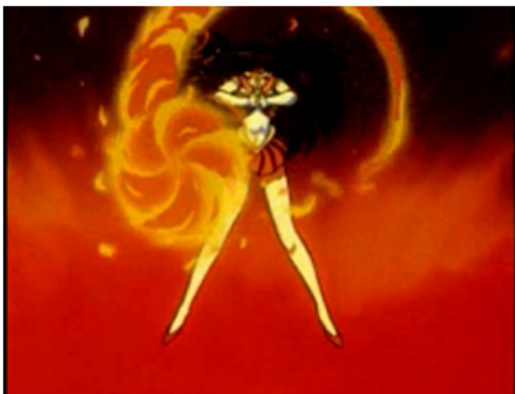
Sailor Mars' Fire Soul Attack, Anime http://wikimoon.org/index.php?title=Fire_Soul

Other inspirations I have for creating my own digital effects and styles come from video game design, concept art, and superheroes who wield powers from the forces of nature, such as in the Anime series Sailor Moon . The art behind the book and TV series Sailor Moon embodies the beautiful and terrifying elements of nature in a surreal style.