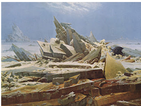
Polar Sea / The Destroyed Hope by Caspar Friedrich http://www.sightswithin.com/Caspar.David.Friedrich/

My creative process then consisted of me sketching compositions and traits of each natural disaster from my research. I would later scan my best sketches to use as references for when I would digitally paint in Adobe Photoshop. At first I did most of my sketches on tracing paper with Copic markers, pens, color pencils, and caracole, but encountered the problem of not capturing the storms' identities well enough. I explored other media and discovered that pastels were the best to sketch with, especially for my hurricane studies. Wind, water, and fire were the three elements of nature that I identified for the most powerful and recognizable natural disasters. I decided to dedicate my work to depict a tornado, hurricane, and volcanic eruption in a sublime style that derived from my research.