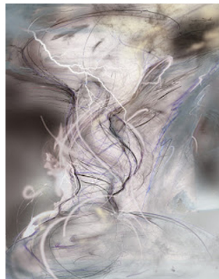
One of my early Tornado sketches.

Other things I found fascinating were stories, such as The Wizard of Oz , that used tornadoes as a metaphor for change or devastating events such as the Great Depression. These stories added a supernatural element to my work, which I incorporated by using heavier shadows and contrasting colors. I also enjoyed reading Legends of Landforms: Native American Lore and the Geology of the Land by Carole G. Vogel. It described the formation of mountains and hills in a mystical way by