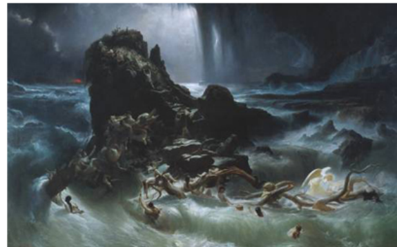
The Deluge, 1840 by Francis Danby

Other artists' work that I found related to these paintings and nature through the sublime were Francis Danby and Joseph Wright. Danby's The Deluge plays with the eerie power of water while Derby's Vesuvius in Eruption, with a View over the Islands in the Bay of Naples presents a sense of oncoming catastrophe with high-contrast colors. I found their work, like Turner's, relating to ideas of nature and the sublime from Schama's Landscape and