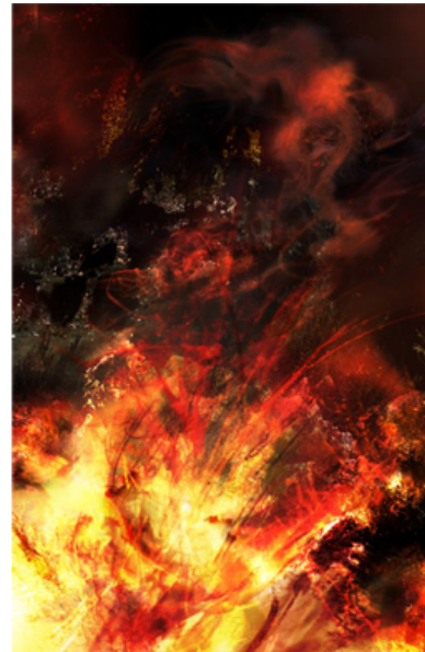
My digital volcanic eruption.

was distinctive as it consisted of warmer color tones that embodied bolts of energy more obviously than any of the colors I was using before. Keywords I worked with for my volcanic eruption were epic, burst, fierce, vast, blood veins, muddy, doughy, walls or mountains of fire. I studied a lot of photographs and myths about volcanoes so that I could create an immersive and overwhelming composition that captured the experience of discovering a towering volcano. The textures Edward Burtynsky captured in his photographs from Manufactured Landscapes were full of awe and inspiration. A lot of his eroded landscape photographs looked just like lava, setting up the image of the earth bleeding out or being scrapped off. Also in his work were brown and red polluted trails of water that would cut up rocky terrains, making it look like the earth was about to shatter. I also added this kind of effect to my volcano so it would feel like it was about to shatter or explode in your face.