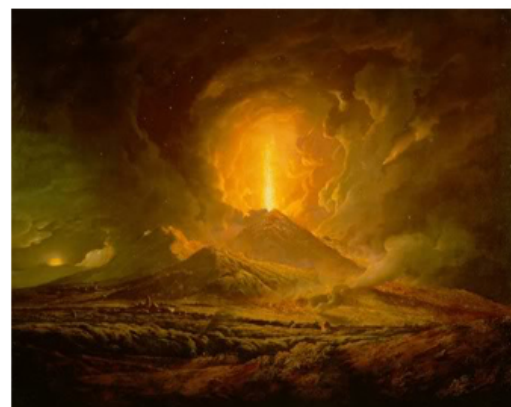
Vesuvius from Portici by Joseph Wright of Derby http://volcanism.wordpress.com

Another great resource that helped me capture the vast and bursting effects of a volcano was The Red Volcanoes: Face to Face with the Mountains of Fire , featuring breathtaking photos by national volcanologist Jack Lockwood. The full range of colors and close-ups of lava were fantastic because they made me visualize veins and bread dough. I also envisioned piles of cigarettes, fumes, and different forms of smoke and ash mixed together, which I later painted digitally. Also in this great book were the Hawaiian legends of Pele the fire Goddess. Pele has many forms and is usually charming, playful, and tempts other gods, but can also be a wrathful old hag who is violent and spiteful. Her description, along with other Greek storm Gods, showed the paradox of being beautiful, nice, ugly, and terrible at the same time,