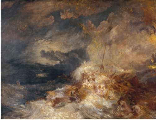
A Disaster at Sea. by J.M.W. Turner

newly discovered lands. I studied Friedrich's Polar Sea / The Destroyed Hope , which reminded me of my rocky volcano, and discovered how he created a sublime setting by referencing natural light to feature the still-pointy rocks that look threatening yet alluring. I found Turner's work to be more abstract and that encouraged me to abstract the forms of my natural disasters, adding enticing visual interest to my work. I