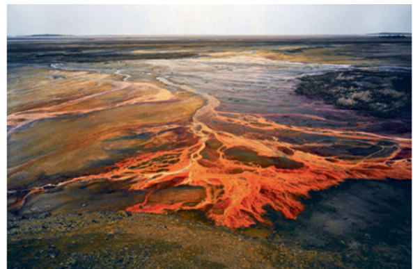
Tailings #30, Sudbury, Ontario, 1996, by Edward Burtynsky http://www.virtualdavis.com/2010/12/

Researching volcanic eruptions highlighted the element of fire in a much more jarring way than the elements of wind and water that I was working with before. The color palette for my volcanic eruption