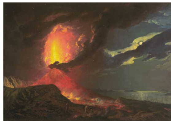
Vesuvius in Eruption, with a View over the Islands in the Bay of Naples by Joseph Wright of Derby http://www.thearttribune.com/Art-and-the-Sublime.html