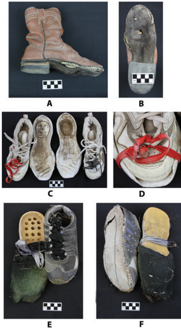
FIGURE 12. Shoes with use-wear. A-B) A child's cowboy boot with hole worn through the sole. C-D) A woman's sneaker with detached soles. A red bra strap was used to re-fasten the two parts. E-F) Shoe with detached sole that the user has attempted to re-connect with a sock and binding from a t-shirt.

Border crossers, even first-timers, are often aware of the general obstacles involved in the process. Still, this phenomenon is chaotic and rife with physical and emotional difficulties that can make focusing on the minutia of material culture quite challenging. The tendency to downplay or ignore material culture in this setting relates to what Miller calls the “humility of things”: