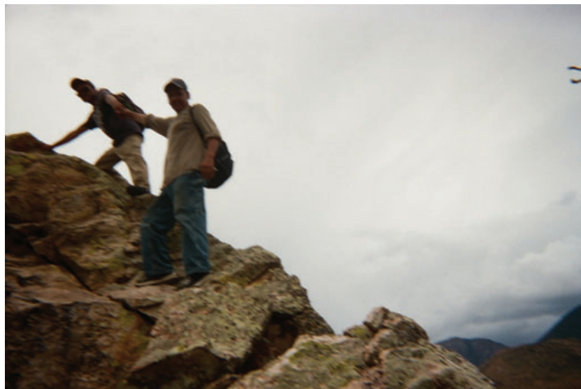
FIGURE 10. Climbing over rocky terrain in sneakers

Dark clothes absorb more heat, which can raise a person's core temperature and increase the rate of dehydration and heat-related exhaustion. Compounding the issue of heat absorption is the added weight of thick insulated clothes and a heavy backpack along with the low moisture permeability of material such as denim. Together, these factors contribute to increased physiological strain in the form of more wetted skin, higher skin temperatures, and greater general discomfort. This stress is often seen in the recovered clothes and backpacks that emit intense perspiration odor and display large, crystalline sweat stains.