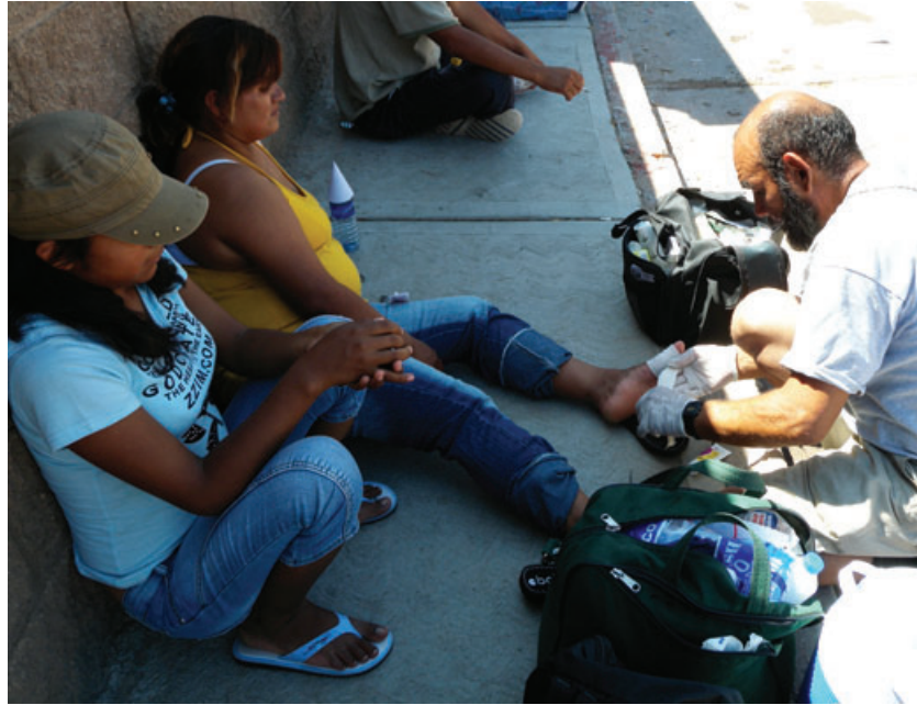
FIGURE 11. A woman having her blisters bandaged after a failed desert crossing

The physical stress caused by wearing dark clothes impacts people individually, but for migrants as a group these clothes create the unwanted signal that a person is a border crosser. Border Patrol agents I have spoken with commented that when using remote cameras or visual spotting techniques they can easily distinguish among hikers, narco-traffickers, and migrants based on a combination of phenotype, clothing style, backpacks, water bottles, and behavior. In essence, walking through the desert wearing dark clothing arouses suspicion. My personal tendency to wear dark clothes and a large backpack while conducting archaeological surveys has repeatedly caused me to be dusted by Border Patrol helicopters and stopped and questioned by agents on the ground. 4 It is not just agents who read signals from migrant clothing. Both the bajadores who assault migrants in the desert and the criminals who prey on recently deported people at ports of entry use clothing as an indentifying characteristic when selecting their victims (De León in press).