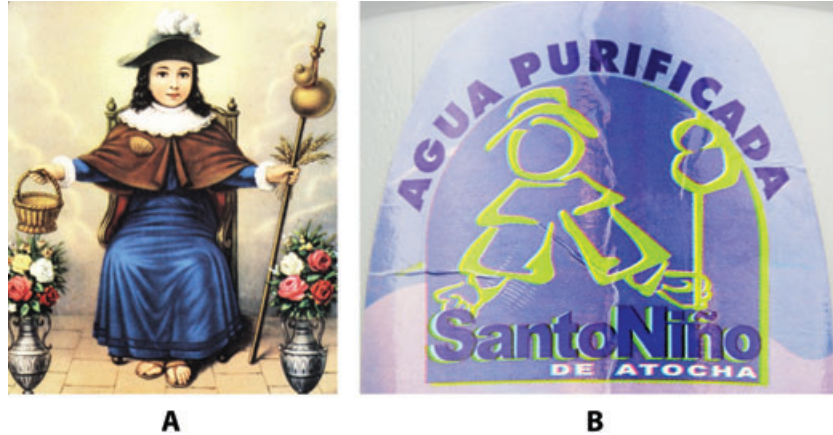
FIGURE 5. A) Santo Niño de Atocha is a Latino version of the Christ child who is thought to assist travelers on journeys. B) A bottle from the Santo Niño de Atocha factory in Altar, Sonora, Mexico

just take little sips of my bottle and hope that I find more water along the way if I run out.