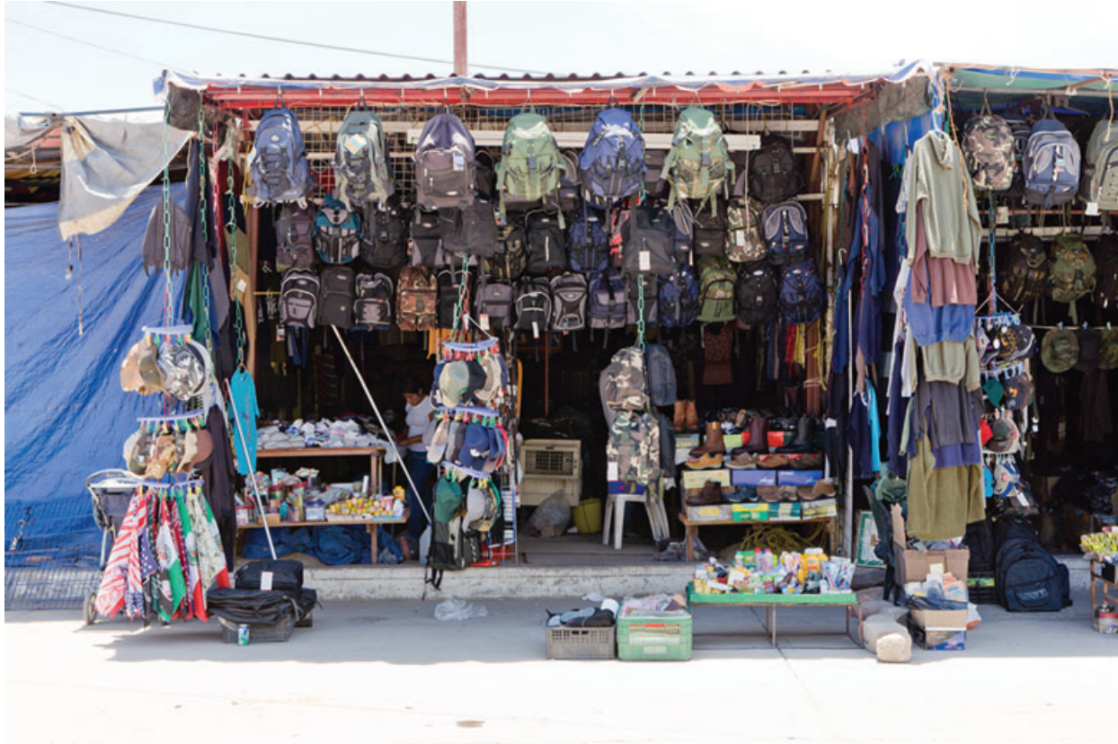
FIGURE 3. Vendor in Altar, Sonora, Mexico that specializes in migrant goods.