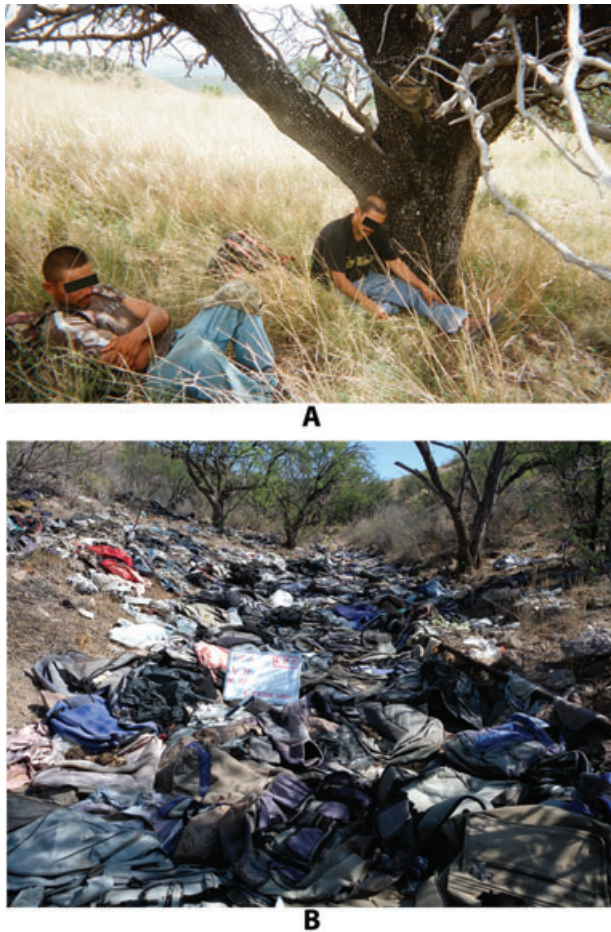
FIGURE 2. A) Resting at a migrant station. B) Over the course of repeated use, migrant stations can develop into sizeable archaeological sites

(e.g., motion sensors), and the desert itself all contribute to a hostile and oppressive environment for migrants.