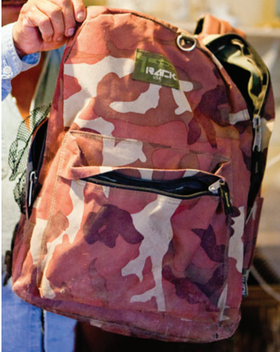
FIGURE 14. Victor and his backpack.

to be a wild animal). Migrants often lack the means to critically evaluate and test different techniques in the desert, and many will often accept that certain technologies are effective (even if they are not) because they see others using them. The BCSS has its own internal logic that is difficult to critique from within the system. Furthermore, the BCSS is not strongly regulated, and misinformation can both easily be incorporated into and perpetuated by the system. A migrant's crossing success is strongly determined by tenacity and luck (Cornelius et al. 2008), which means many have been able to cross despite their use of seemingly harmful techniques.