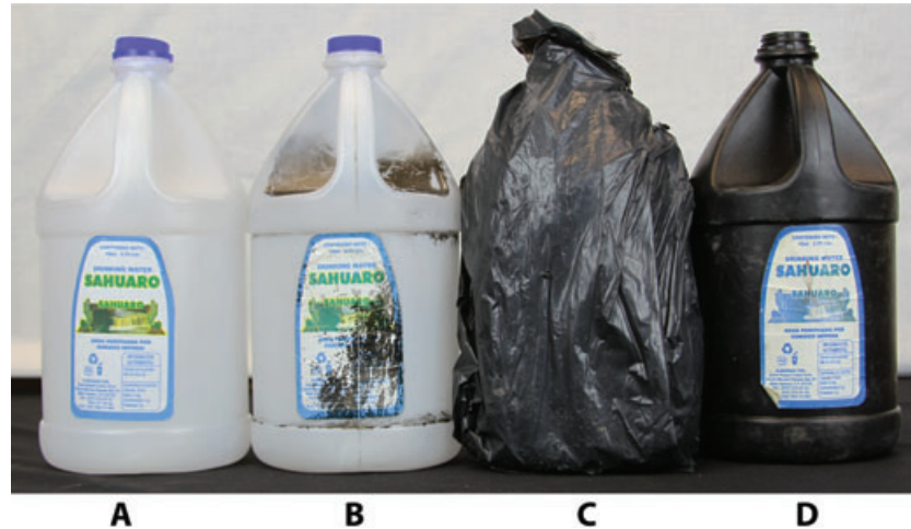
FIGURE 4. A) One gallon white bottle. B) Bottle with plastic cover. C) Bottle that was once painted black with shoe polish. D) Black plastic bottle

assumption is that white bottles are a disadvantage. As one person stated: “We got caught on the first night of our trip because Border Patrol saw the light reflecting off of a water bottle.” Toward the end of 2009, companies began to produce one gallon bottles out of black plastic (see Figure 4d), a sign that technological changes at the factory level were the direct result of migrant preferences. However, agents working on the ground primarily rely on sign cutting (i.e., foot tracking), ground sensors, infrared cameras, and sound to locate people, suggesting that it is unlikely that darkly colored bottles provide a strong tactical advantage. The insistence by migrants (and border vendors) that camouflaged bottles help you avoid detection probably reflects a combination of people’s lack of understanding about current surveillance technology, as well as entrepreneurial attempts to capitalize on migrant folk logic. In addition to specialized color and shape, many company brand names overtly target migrant consumers and their religious beliefs. For example, one company in Altar is called “Santo Niño de Atocha” and their label features a drawing of the Latino version of the Christ child believed to assist pilgrims on dangerous journeys (Thompson 1994; see Figure 5). To an observer familiar with the BCI (incl. Border Patrol), the shape, color, and labels on these bottles are easily recognized as both being manufactured in Northern Mexico and linked to undocumented migration.