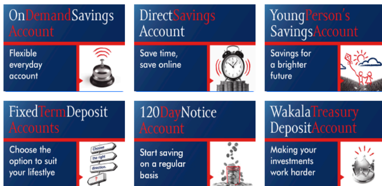
Figure 1: Islamic savings account services featured on the Islamic Bank of Britain.

investor concerns. And while the issue of incomplete shari'ah -compliance on savings accounts remained, it had not diminished demand for Islamic savings accounts. The UK's flagship retail Islamic bank, the Islamic Bank of Britain, recorded that its deposits had reached £186.6 million by the end of 2009. 148 IBB has since developed a wide line of savings account services (see Figure 1). Chapters VII and VIII cover issues in Islamic retail banking in the UK and France more fully.