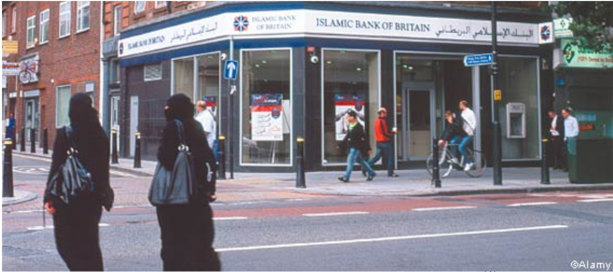
Figure 1: An Islamic Bank of Britain branch. 164

Second, as a consequence, it is likely that many French Muslims are not aware of Islamic banking in Europe. Further, scholars have theorized that many Muslims are not aware of the financial and commercial components of Islamic law, 165 including the ban on riba (usury) and gharar (speculative gain). This forms a circular structure of disinvestment where France’s basic lacking of Islamic banks leads to a lack of education among Muslims that Islamic finance exists or could exist in France. This in turn leads to an often perceived under-demand for Islamic financial products and services, which finally discourages the establishment of Islamic banks in France (see Figure 2).