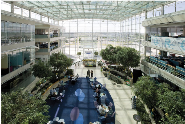
Figure 1. The UK headquarters of Procter and Gamble in London, financed by Gatehouse Bank.

London (see Figure 1). 283 By the end of 2011, it was estimated that Gatehouse had financed over £280,000,000 in real estate. 284