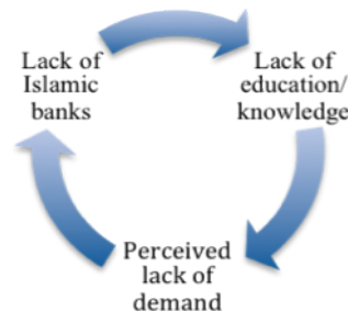
Figure 2: Cycle of Disinvestment in Islamic Finance in France

Second, as a consequence, it is likely that many French Muslims are not aware of Islamic banking in Europe. Further, scholars have theorized that many Muslims are not aware of the financial and commercial components of Islamic law, 165 including the ban on riba (usury) and gharar (speculative gain). This forms a circular structure of disinvestment where France’s basic lacking of Islamic banks leads to a lack of education among Muslims that Islamic finance exists or could exist in France. This in turn leads to an often perceived under-demand for Islamic financial products and services, which finally discourages the establishment of Islamic banks in France (see Figure 2).