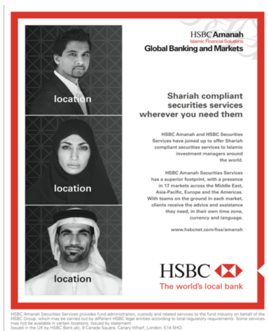
Figure 0: HSBC Amanah advertisement, which appeared in the Financial Times in 2011. See Financial Times, “Special Report: Islamic Finance,” Financial Times , May 12, 2011, 3.

the sense of liberty to emphasize the religiosity of Islamic finance.