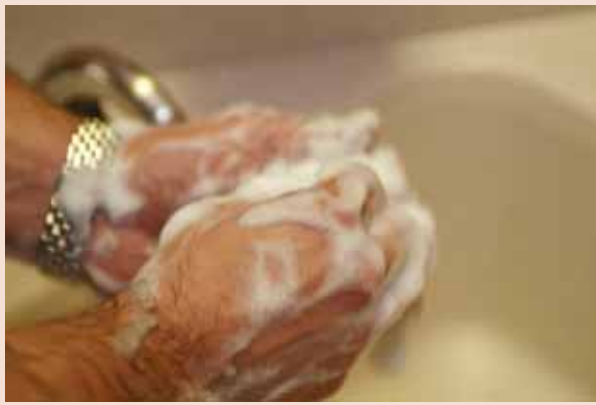
Figure 2. Hand Washing Can Prevent the Transmission of Infection

may be used, although soap and water are preferable if hands are visibly soiled or contaminated with proteinaceous material (Boyce & Pittet). Thorough drying of the hands is important because hands may remain colonized with microorganisms after hand washing if hands are not dried properly (Boyce & Pittet). In clinical situations involving respiratory secretions or handling of objects that may have been contaminated with respiratory secretions, gloves and gowns should be worn (Schulster & Chinn).