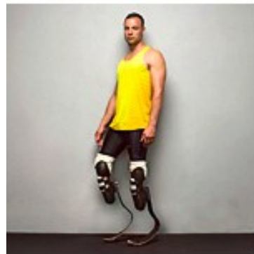
The Fast Life of Oscar Pistorius