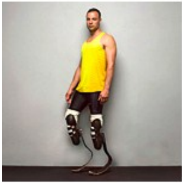
The Fast Life of Oscar Pistorius