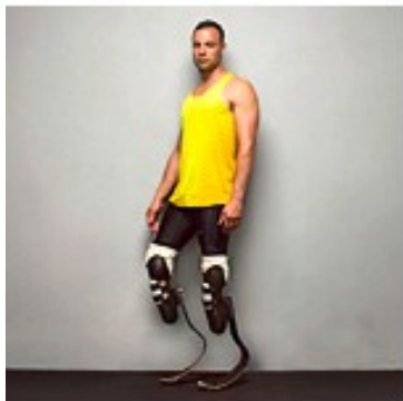
The Fast Life of Oscar Pistorius