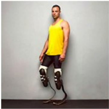
The Fast Life of Oscar Pistorius