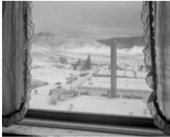
Figure 5. – “Frank’s View”