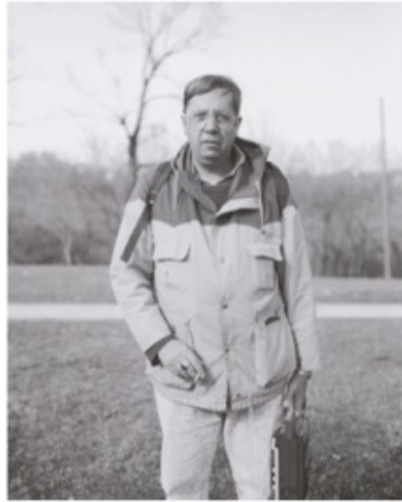
Figure 1. - "Untitled"