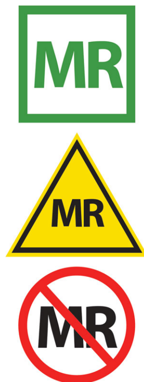
Figure 2. U.S. Food and Drug Administration labeling criteria (developed by ASTM [American Society for Testing and Materials] International) for portable objects taken into Zone IV. Square green “MR safe” label is for wholly nonmetallic objects, triangular yellow label is for objects with “MR conditional” rating, and round red label is for “MR unsafe” objects.

erly identified and appropriately labeled using the current FDA labeling criteria developed by ASTM International in standard ASTM F2503 ( http://www.astm.org ). Those items which are wholly, nonmetallic should be identified with a square green “MR Safe” label. Items which are clearly ferromagnetic should be identified as “MR Unsafe” and labeled appropriately with the corresponding round red label. Objects with an MR Conditional rating should be affixed with a triangular yellow MR Conditional label before being brought into the scan room/Zone IV.