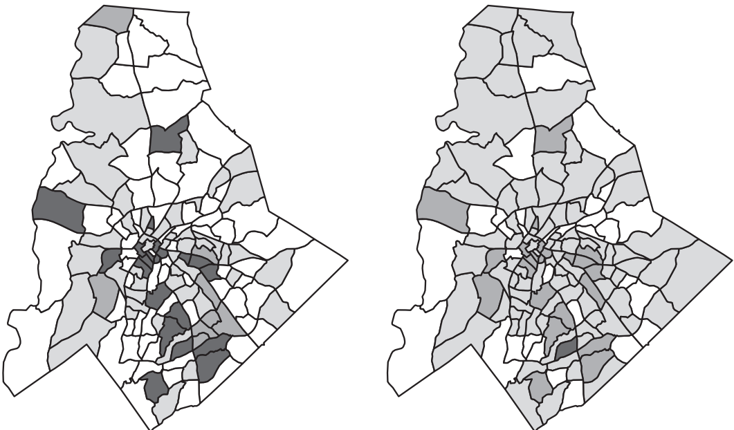
Fig. 2. Baseline tract-specific rates of (a) preterm births (less than 37 gestational weeks) (□, [6.8, 7.25]%; □, [7.25, 7.45]%; ■, [7.45, 7.55]%; ■, [7.55, 8]%) and very preterm birth (less than 34 gestational weeks) (□, [1.45, 1.55]%; □, [1.55, 1.65]%; ■, [1.65, 1.75]%; ■, [1.75, 1.85]%) baseline hazard rates are calculated at the average value of each covariate across all areas; estimates are from a model that includes space–time interaction baseline hazards and average PM 2.5 -levels over the entire pregnancy

†The estimates are presented as approximate relative risks ( 1.927\beta_j ) per inter-quartile range ( 1.37 \mu\text{g m}^{-3} for total cumulative and 4.56 \mu\text{g m}^{-3} for 4-week lag).