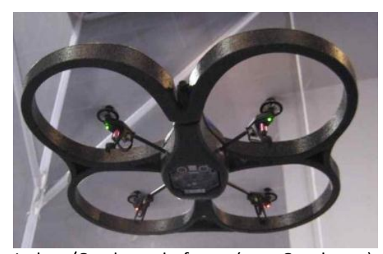
Indoor/Outdoor platforms (e.g., Quadrotor) (Parrot AR.Drone, <u>http://ardrone.parrot.com/parrot-ar-drone/usa/</u>)

summarizes a candidate metric set we propose for consideration, with some data acquired from the Cambone et al UAS Roadmap.<sup>2</sup> Figure 2 shows a cross-section of small UAS applicable for a wide variety of local-area operations, while Figure 3 shows two of the most common long-range, high-altitude large UAS models operated by public and civil US agencies, Predator and Global Hawk. Figure 4 shows an example UAS ground control station developed by NASA; while this example is intentionally similar to a transport aircraft cockpit, the UAS pilots remain necessarily separated from the UAS, a critical distinction that will impact numerous CFRs as illustrated above for 23.143. As is clear from these figures, the set of possible UAS configurations is perhaps even more varied than the set of manned aircraft configurations for which the CFRs were defined. Their operational uses are equally diverse. While UAS CFRs must be responsive to the formidable set of possible attribute-value combinations depicted in Table 2, the number of distinct classifications must be minimized to avoid attempts to develop an unmanageable set of UAS CFRs.