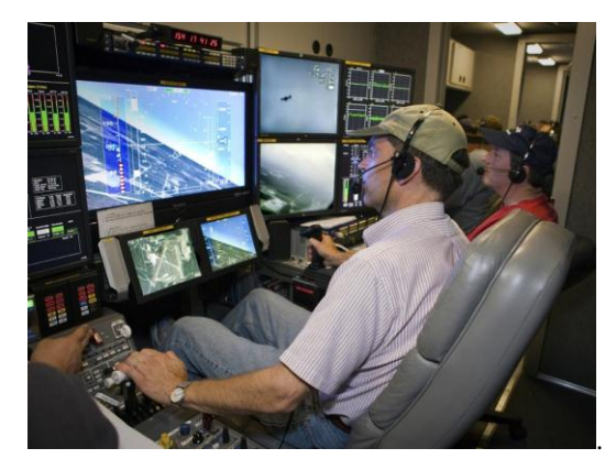
Figure 4: Example UAS Ground Station (NASA's AirSTAR)<sup>§</sup> http://www.nasa.gov/centers/langley/multimedia/iotw-airstar.html