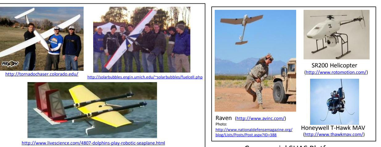
University Aeronautics & Science Research Platforms