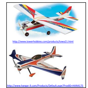
Aerobatic R/C "Conversions"