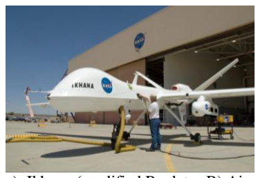
a) Ikhana (modified Predator B) Aircraft.