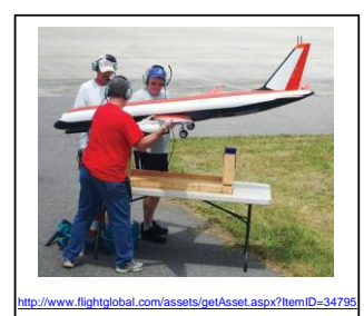
Manned Aircraft Simulation via UAS (NASA's AirSTAR)