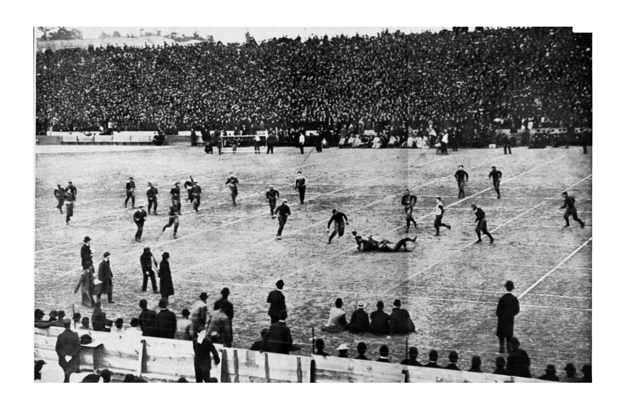
Figure 2: Football game between Yale and Princeton in 1904