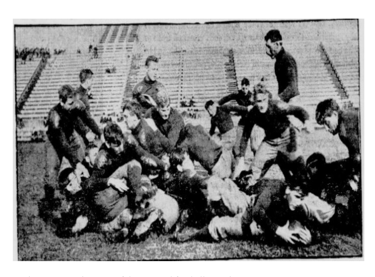
Figure 1: A scrimmage of the Harvard football team in 1902