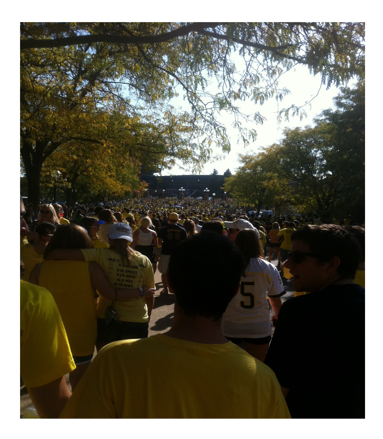
Figure 4: Fans walk towards Michigan Stadium before a football game in September 2010