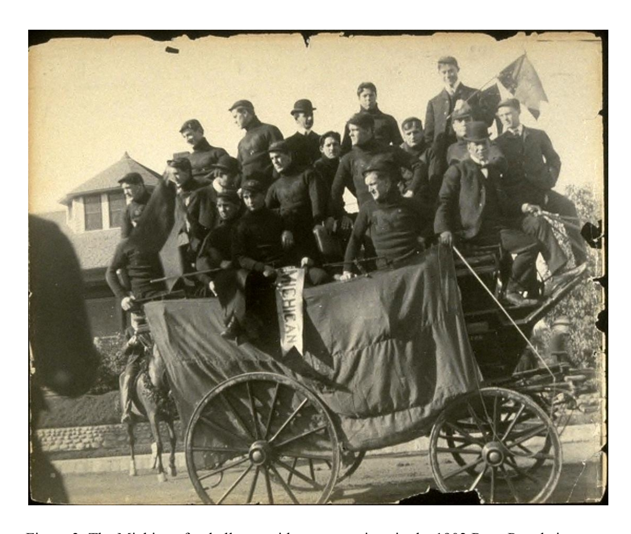
Figure 3: The Michigan football team rides on a carriage in the 1902 Rose Parade in Pasadena, California.